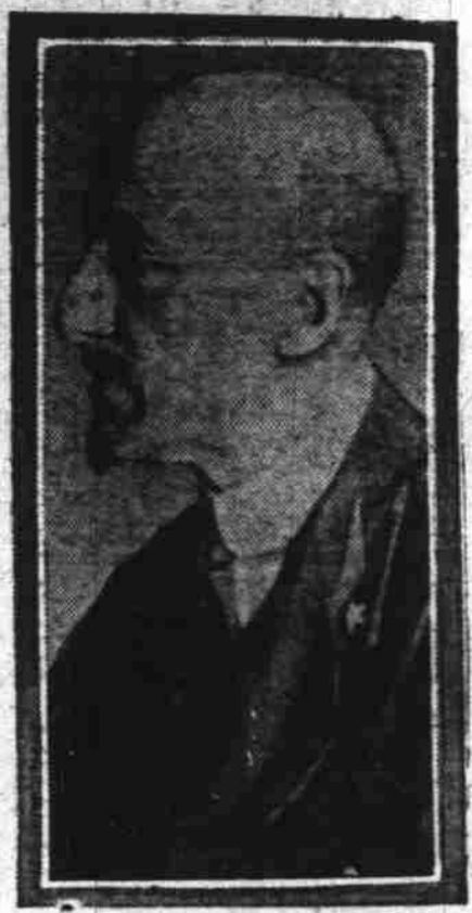
Gabriele D'Annunzio, soldier-poet of Italy whose greatest exploit was the capture of Fiume after the World war in connection with Italy's territorial claims, died Tuesday.

zio, Italy's great warrior-poet, symbol of Italian nationalism and president of the Academy of Italy, died unexpectedly today in his villa Vittoriale.