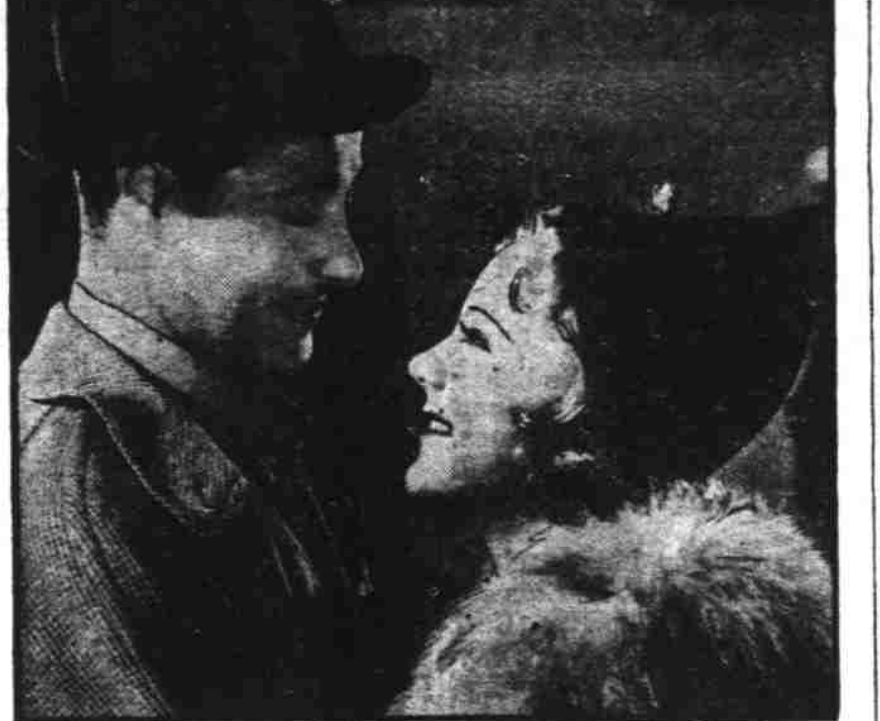
Reunited in romance after their triumph in "One in a Million," Sonja Henie and Don Ameche are radiantly in love in "Happy Landing" featured at the Grand theatre today.