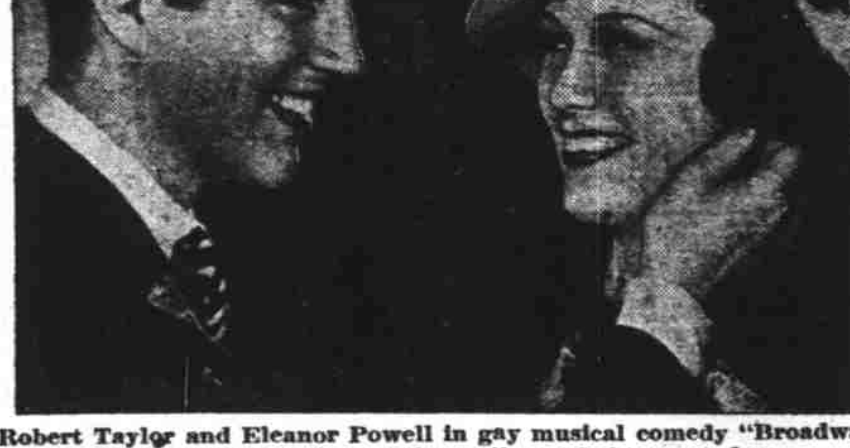
Robert Taylor and Eleanor Powell in gay musical comedy "Broadway Melody of 1938" showing at the Hollywood theatre today.

of fire into "Midburg" that makes the old town ring with action. The staid ladies of "Scandal Street" are panic-stricken when lovely Louise Campbell hits town and starts attracting the admiration of their equally staid and middle-aged husbands. Miss Campbell is put on the spot from the beginning, but she fights their prejudices until the last—or almost the last, when circumstantial evidence points to her as the guilty party to a mysterious murder. Ayres, playing her loyal and believing fiancé, works hand in hand with the arresting little mix, Virginia Weidler, to solve the mystery and clear Miss Campbell's name. Cecil Cunningham, who won fame as the blustering hotel-keeper of Panama in "Swing High, Swing Low," plays the town's fashionable modiste who flings her share of mud at the beautiful newcomer.