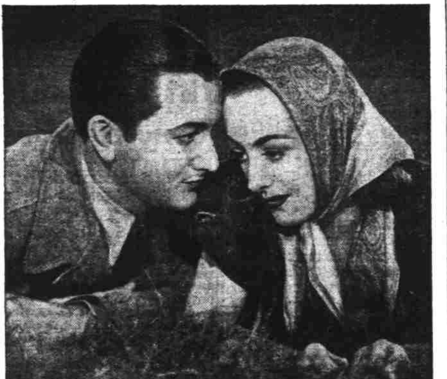
Joan Crawford and Robert Young in "The Bride Wore Red," Joan's new starring vehicle, which will be the headline attraction at the State theatre for three days.