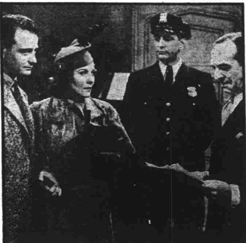
Lew Ayres and Louise Campbell co-starring in murder feature "Scandal Street" opening today at the Capitol theatre.

Lew Ayres and Louise Campbell form a pleasing new romantic team in "Scandal Street," which opens today at the Capitol theatre, to tell a story of how gossip, innocently begun, can form a dragnet to trap the reputation and threaten the life of a beautiful girl. A cast of popular players, including Roscoe Karns, Porter Hall, Edgar Kennedy, Elizabeth Patterson and Virginia Weidler, puts an air of realism and dash