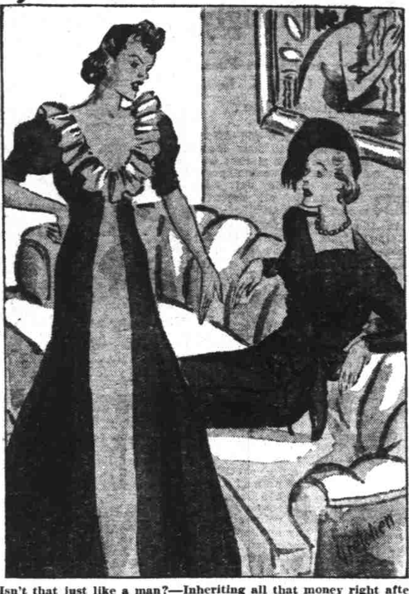
"Isn't that just like a man?-Inheriting all that money right after I threw him over!"

When fate deals out a cruel blow, you'll suffer less if you envelope