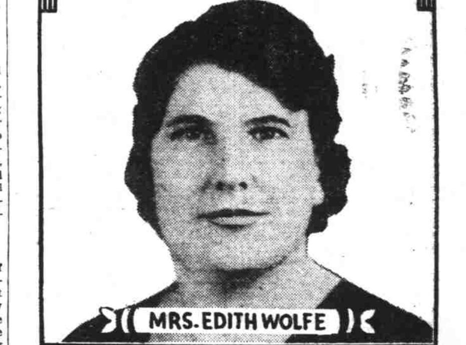
This Widely-Known Lady Tells Below How VAN-TAGE Helped Her. "It Is a Real Honest Medicine and I Am Happy to Endorse It!" She Says. Read Her Amazing Testimonial.