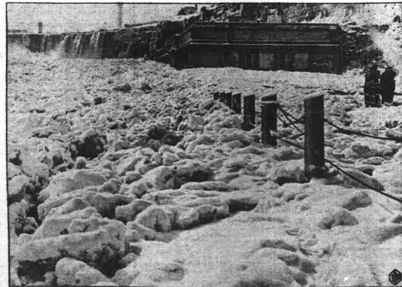
How the ice jammed about the Ontario Hydro-Electric Power plant

Worst ice jam in the history of the Niagara river not only sweeps away the Falls View or "Honey-moon Bridge" but almost engulfs the Ontario Hydro-Electric Power company plant upstream.