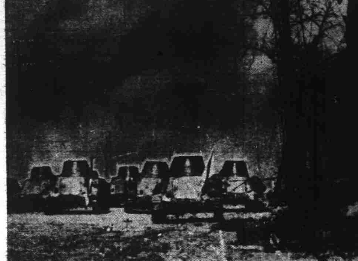
Advancing on Nanking, Chinese Nationalist capital, Japanese tanks are pictured bombarding Chinese battery units. Unretarded in their forward drive the tanks decimated Chinese arsenals and battered their way into the city. One day after the first Japanese units had entered Nanking from the south the entire city was under Japanese control. Haze and smoke shown in the photo was caused by heavy gunfire.