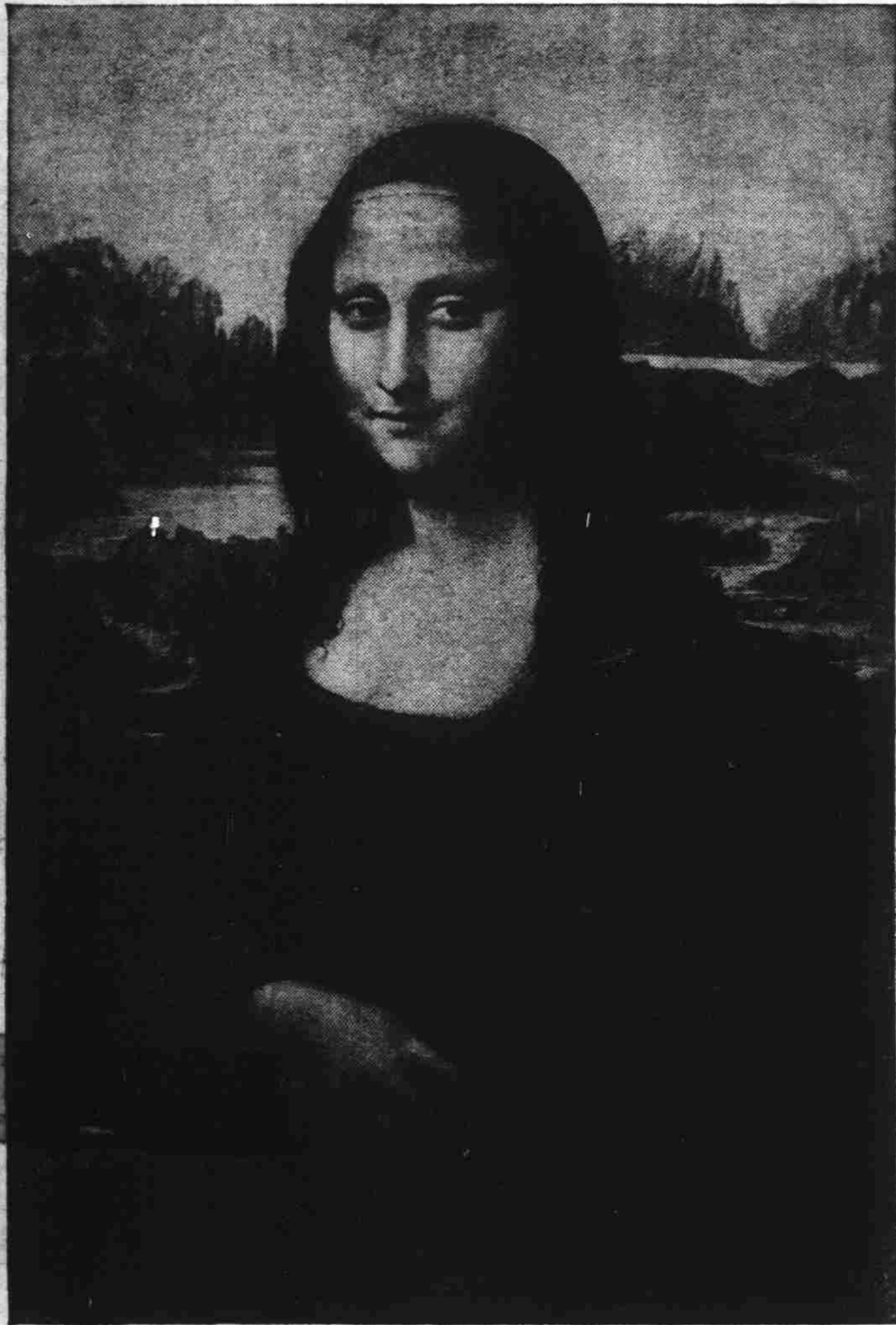
The Most Famous Picture in the World

MONA LISA by LEONARDO DA VINCI (1452-1519). Hanging in the Louvre, Paris, this picture has probably been seen by more people than any other painting. The Mona Lisa was stolen in 1911 and for two years the whole world searched for it. In 1913 it was found in the home of an obscure workman who carried it out of the Louvre under his coat. It is alleged he stole it for the Italian poet Gabriele d'Annunzio who had fallen in love with the lady's haunting smile. The pleasing, fleeting smile has defied description through the centuries. . . . Da Vinci is said to have had the finest mind yet given to man. He was an architect, engineer, mathematician, anatomist, scientist, inventor, sculptor, poet and musician. He invented an army tank and made drawings of aeroplanes. . . . History says there was no romance in his life. There is no mention of a beloved in his "Notebook."