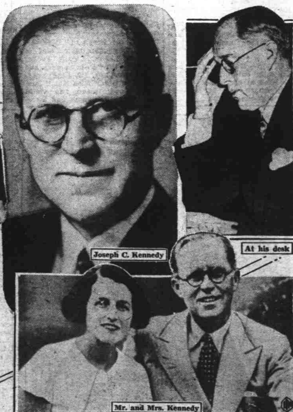
job of straightening out the maritime commission, and now goes to the Court of St. James. Kennedy is the son of a wealthy Boston Irish politician and business man, and is himself a millionaire several times over. Although only 46, he rates as one of the shrewdest minds linked with the administration. He is married to the daughter of a former Boston mayor and has nine children.