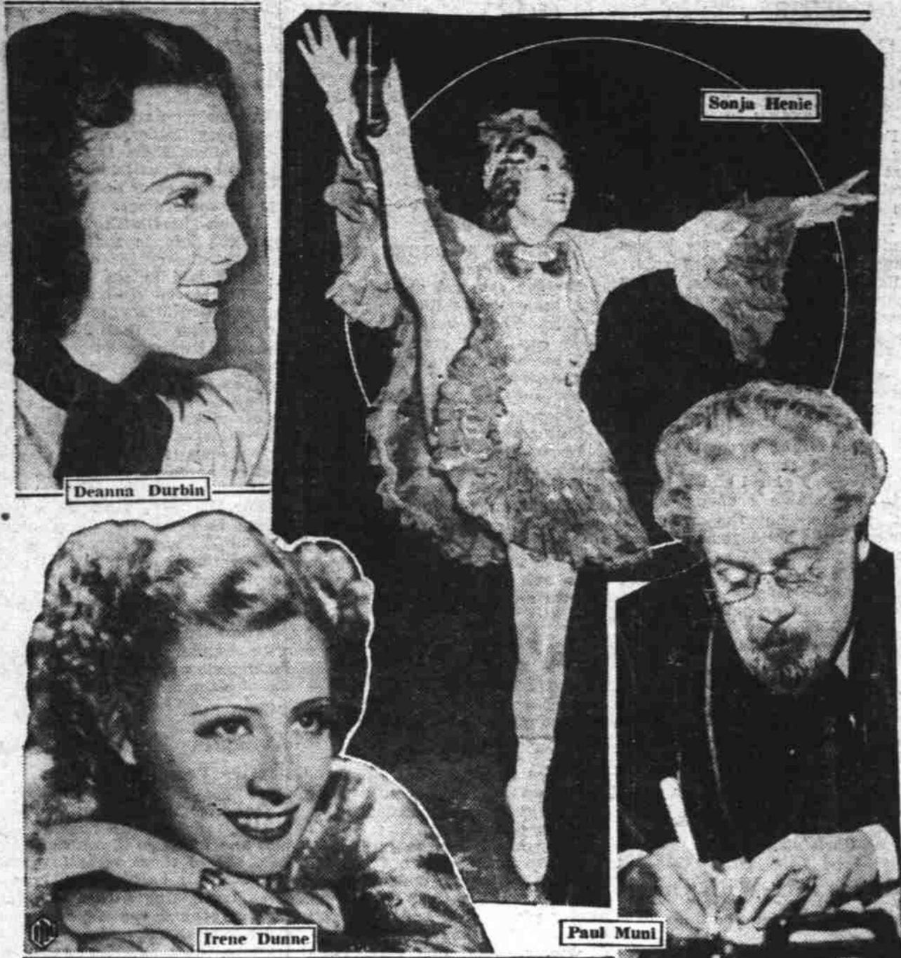
Here are four of Hollywood's most successful stars during 1937, two of them newcomers to the screen. Each was featured in two box-office hits which were among the 20 best pictures of the year. Irene Dunne came through with superb performances in two clever comedies, "Theodora Goes Wild" and "The Awful Truth". Paul Muni has to his credit two of the finest productions in Hollywood history.