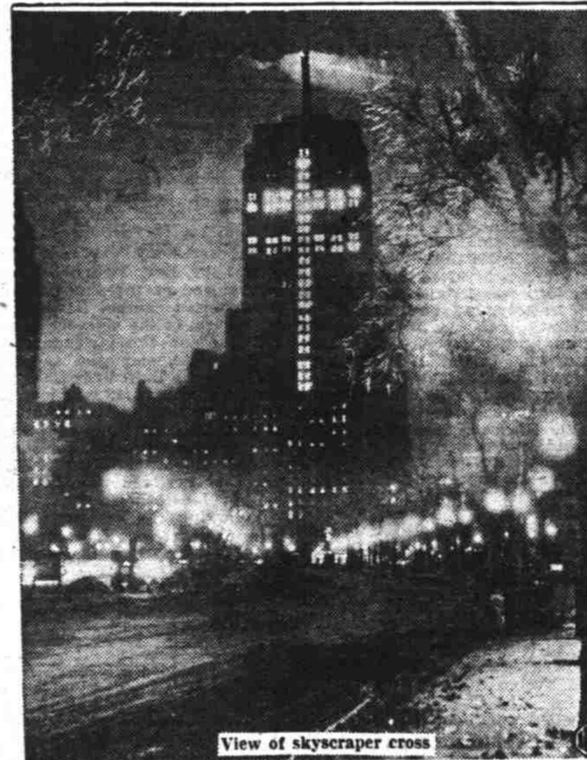
An impressive double-barré cross, 300 feet high and 120 feet wide, formed by a special lighting pattern in the windows of a Chicago skyscraper, aids in the sale of Christmas seals which finance the campaign against tuberculosis.