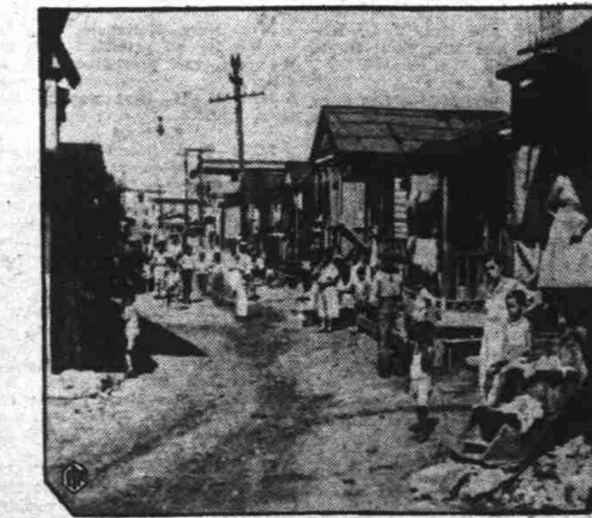
Long held in the grip of the depression, Puerto Rico apparently is finding its way back to a more balanced economy as a result of a reconstruction program instituted by the United States government. The program of the Puerto Rico reconstruction administration is aimed at checking certain economic tendencies which are said to have created widespread poverty among the 1,800,000 citizens. Chief trends which the government is combatting are: Concentration of land in too few hands, concentration of population in urban areas, absentee ownership of key properties, one-crop farming and poor sanitary conditions.