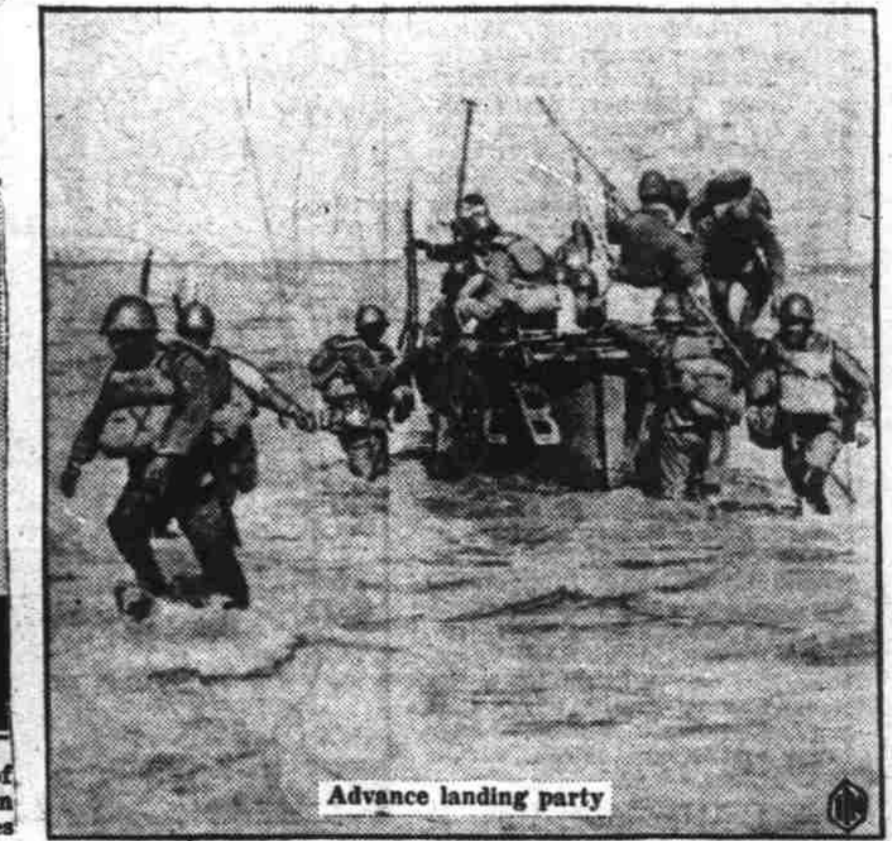
Japanese occupation of the vast territory in central China they now hold was made directly possible when attack units landed on the south bank of the Yangtze river, above, 45 miles from Shanghai and turned the flank of the Chinese defense position, resulting in the fall of Soochow.