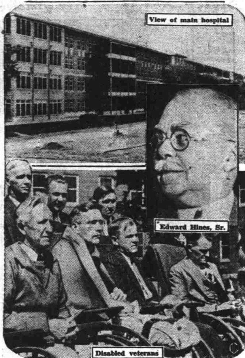
Completion of another year of service by the huge Edward Hines, Jr., hospital in Chicago calls attention to the outstanding record of this institution devoted to caring for disabled American veterans. It was dedicated in 1921 in honor of Edward Hines, Jr., a lieutenant killed in action and the son of a prominent Chicago industrialist whose generosity made the project possible. The outlay is now valued in excess of $15,000,000 and comprises 23 buildings with accommodations for 1,750 patients.