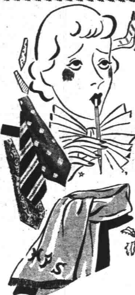
Beautiful Silks and Botany Wools, all newest colors... $1.00 up

The Nurses' association is having its annual party on Monday, December 27, at the Nurses' home at the state tuberculosis hospital.