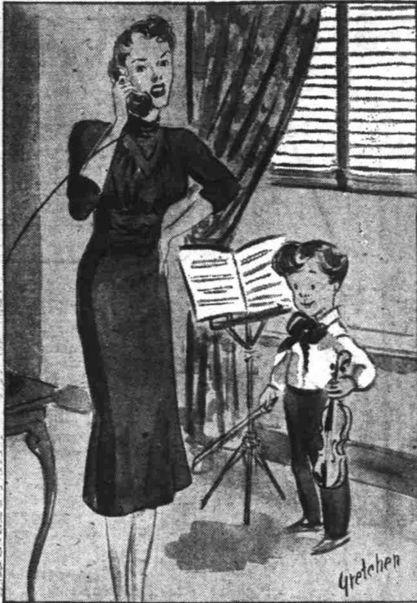
"I wish you'd speak to Junior when you come home. He's been swinging the Brahms concerto in G Major again!"