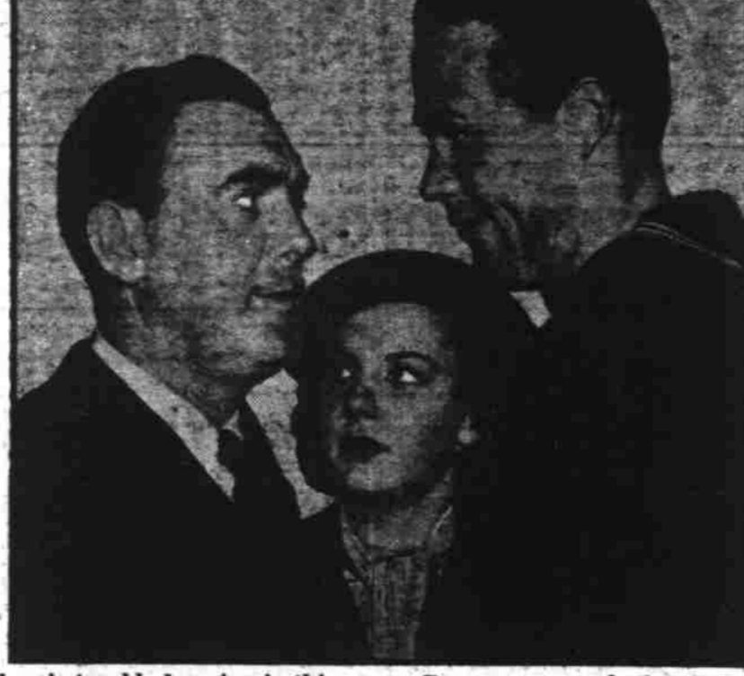
There's trouble brewing in this scene. Can you guess whether the girl likes Pat O'Brien or Wayne Morris just by the picture? Nevertheless, "Submarine D-1," which is the special Mickey Mouse feature today, is packed with far more action scenes than this. Over one million dollars was spent in bringing you this undersea drama.