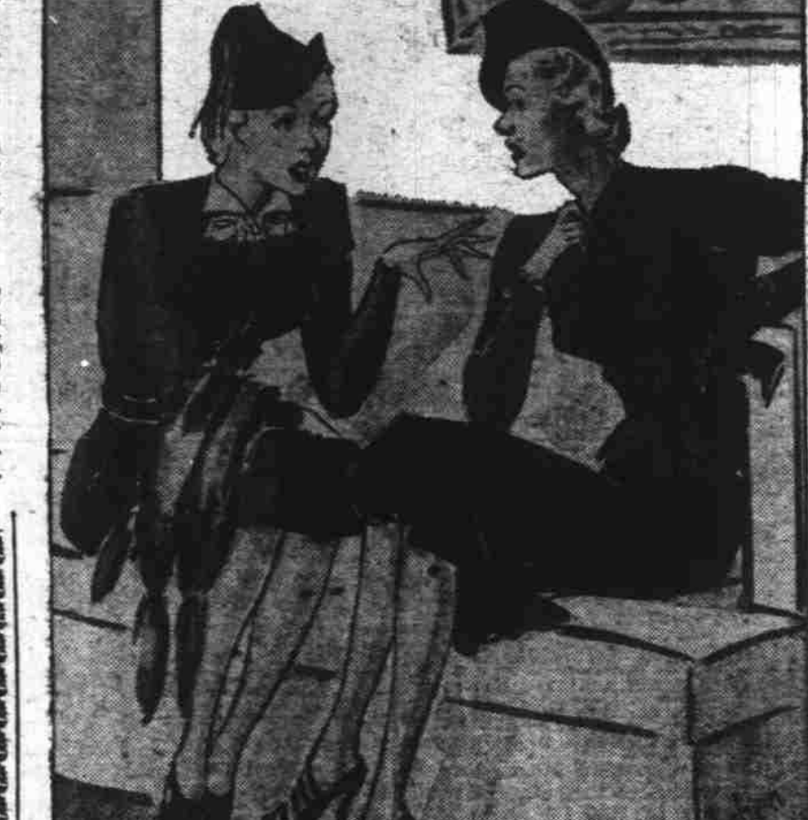
"I had to run up an enormous bill in the beauty shop before the wom an in the next booth finished gossiping!"

Well, of course, that's one time when economy would be a distinct disadvantage. . . Another time is when buying a "mainstay" daytime dress—the kind that will see you smartly through sunset hours. As a case in point, we recommend the wine wool on the left with its petite pink collar. The toppling hat with its fringe tail matches the dress. Nor is the sable scarf amiss. The black woolen suit-dress on the right fills the same function with its black soutache embroidery border and the gay simplicity of string ties for closing .- Copyright 1937, Esquire Features, Inc.