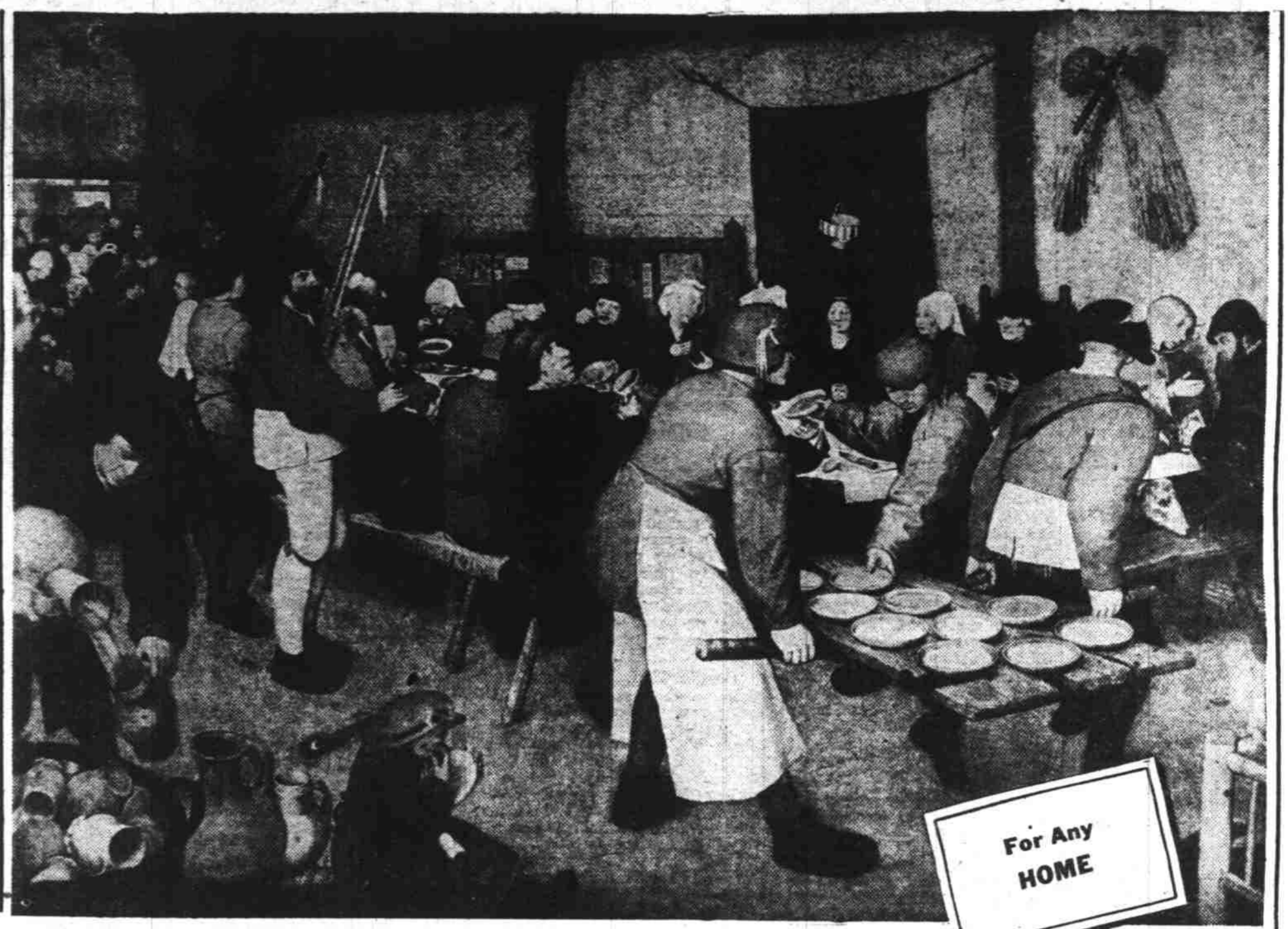
For Any HOME