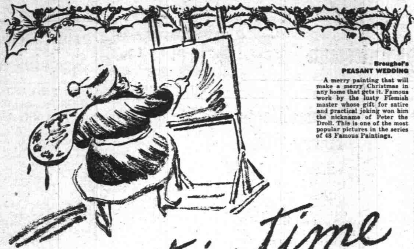
Brough's PEASANT WEDDING A merry painting that will make a merry Christmas in any home that gets it. Famous work by the lusty Flemish master whose gift for satire and practical joking won him the nickname of Peter the Droll. This is one of the most popular pictures in the series of 48 Famous Paintings.