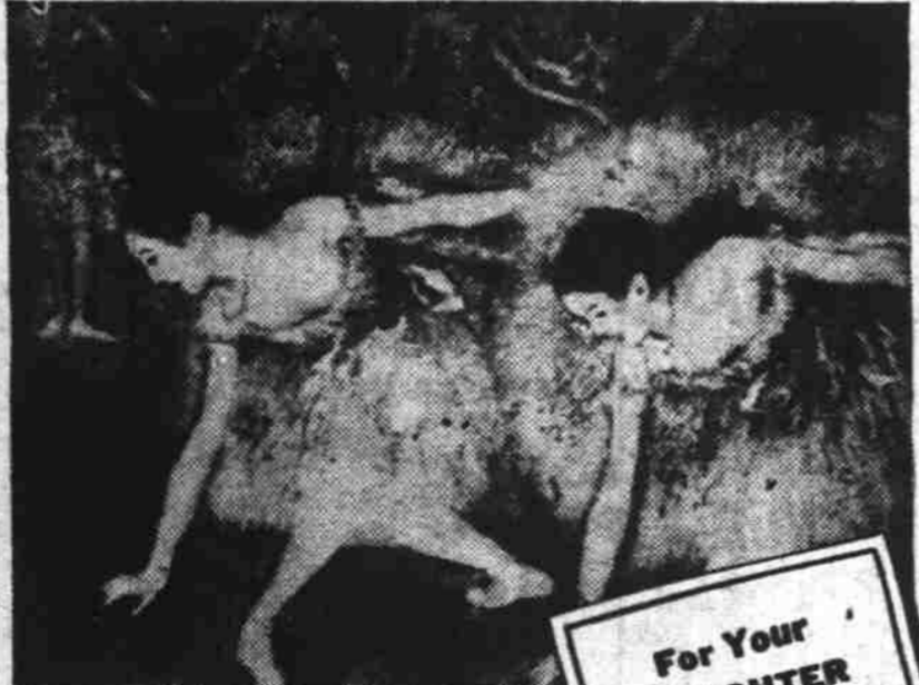
For Your DAUGHTER