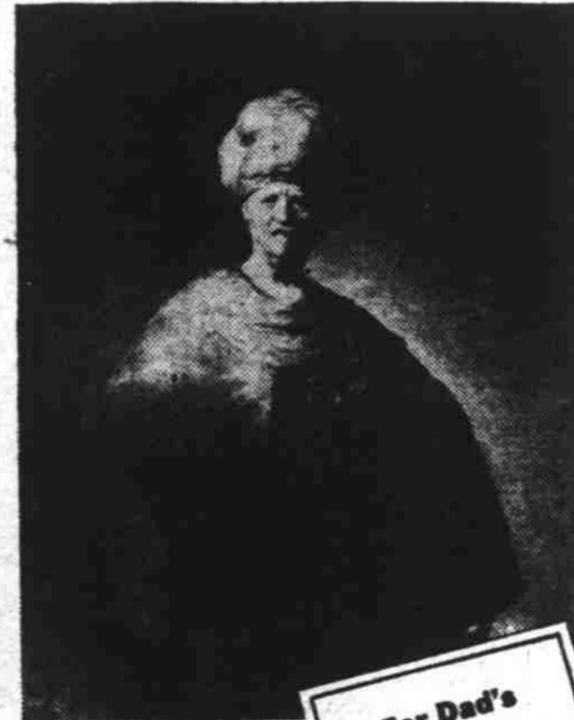
For Dad's OFFICE