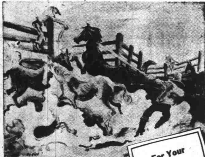
For Your SON