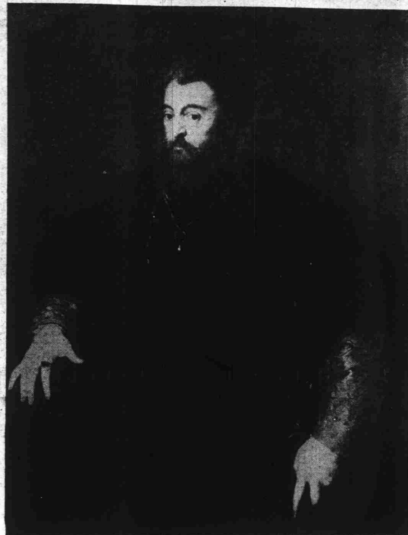
Titian's "Duke of Ferrara"

The Art Portfolio will be given free to those who get the complete collection and who save the Portfolio Certificate which will be sent to you with each week's set of pictures.