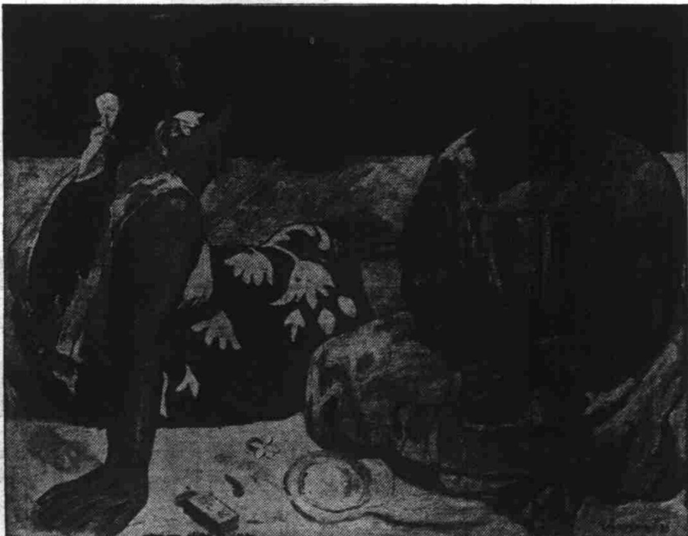
Gauguin's "Tahitian Women"