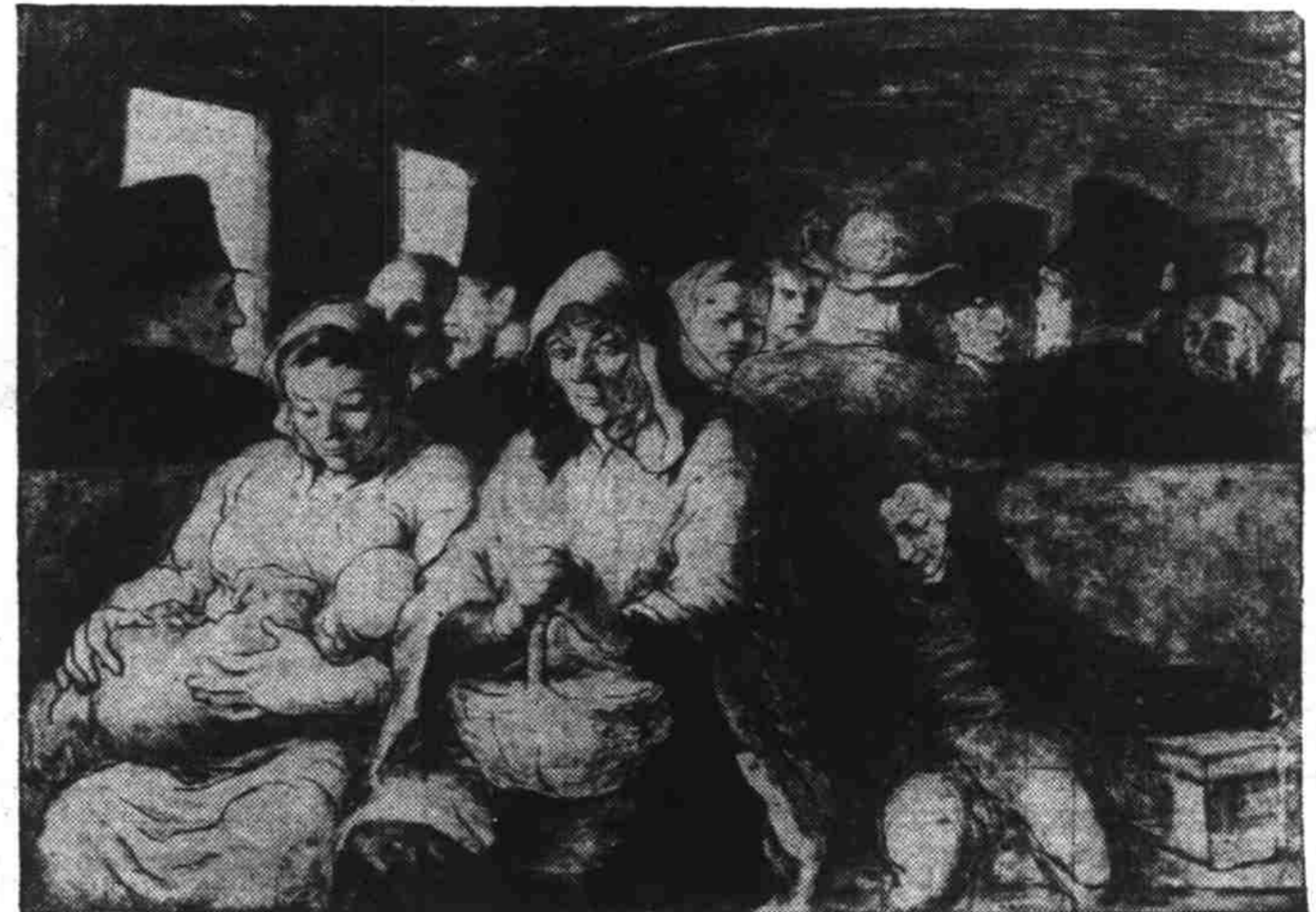
Daumier's "Third Class Carriage"

THIRD CLASS CARRIAGE by HONORE DAUMIER (1808-1879) portrays a few of the tired and burdened of the world, traveling to their destinations that are probably third class too, caught for all time by Daumier's stirring talent. . . . At 40 Daumier gave up his work as a newspaper cartoonist to devote himself entirely to painting. But no one would buy his pictures though this was his finest creative period. . . . Corot saved him from utter destitution. Appreciating the great talent of Daumier, he gave him a small house in the country, "You are the only man from whom I could take such a present and not be humiliated," Daumier wrote him. . . . This man, whom some call the greatest of French painters, served a period in jail and died penniless and blind. Paris, which is so full of statues to the great of France, has yet to recognize his genius.