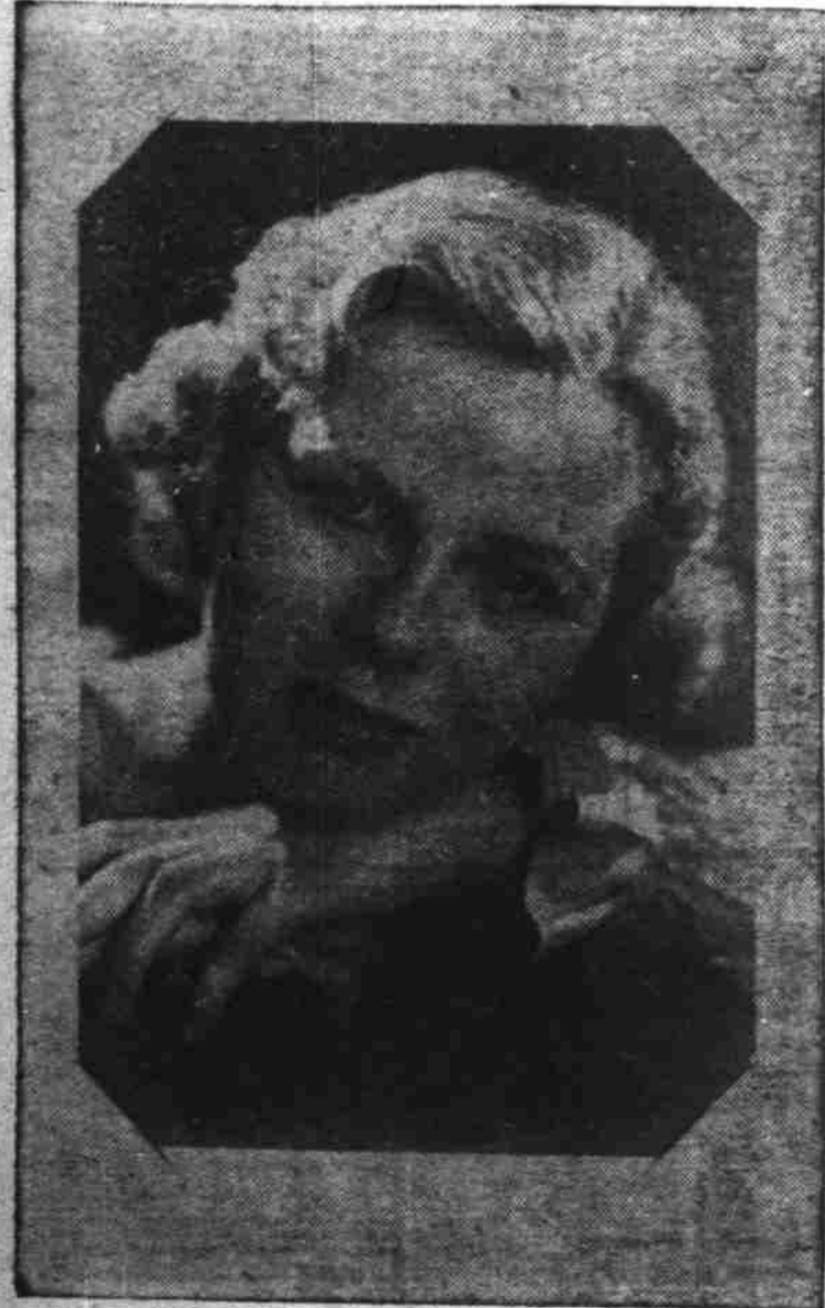
This Size 3x5