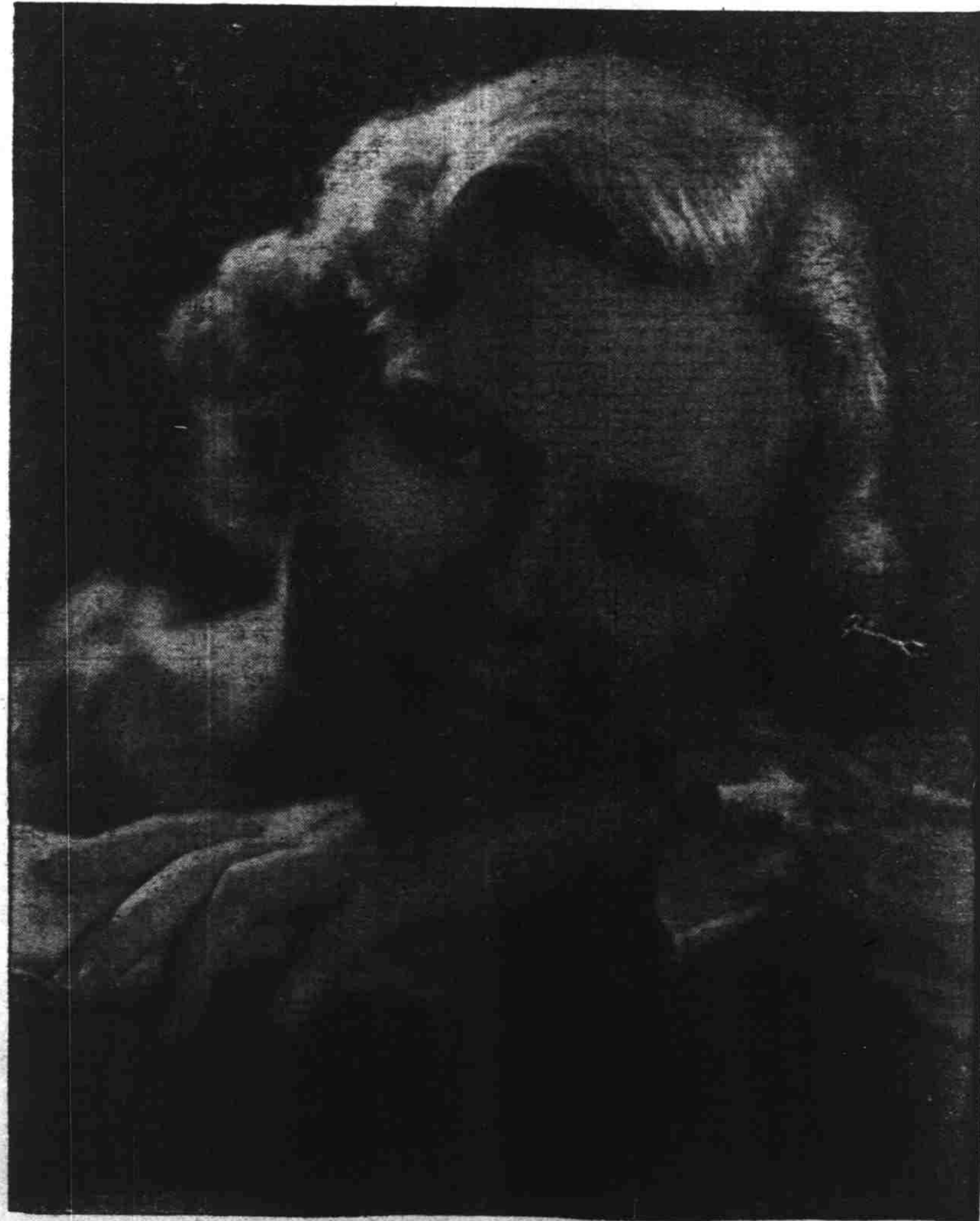
This Size 8x10