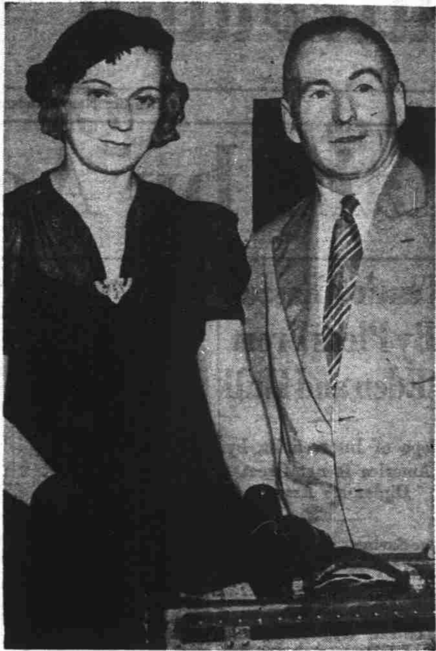
Governor Robert Quinn of Rhode Island and his wife, who were recently closely guarded by police following receipt of a bomb threat in a mysterious letter. Governor Quinn at the time was engaged in a heated controversy with the management of Narragansett race track, and police believe the threat to be the work of a "crank."