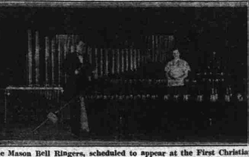
The Mason Bell Ringers, scheduled to appear at the First Christian church Thursday night.