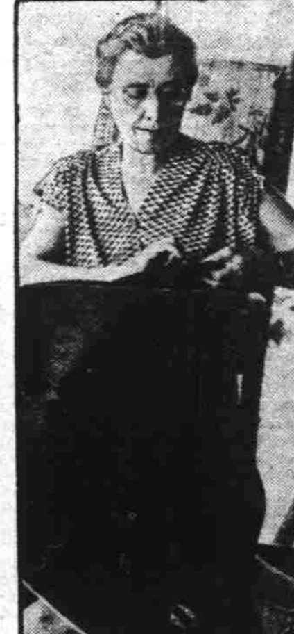
This informal photo of Mrs. Grace Coolidge, one of the best recent studies of the late president's widow, shows her as she knitted on the porch of a friend with whom she was vacationing at Northport, Me.