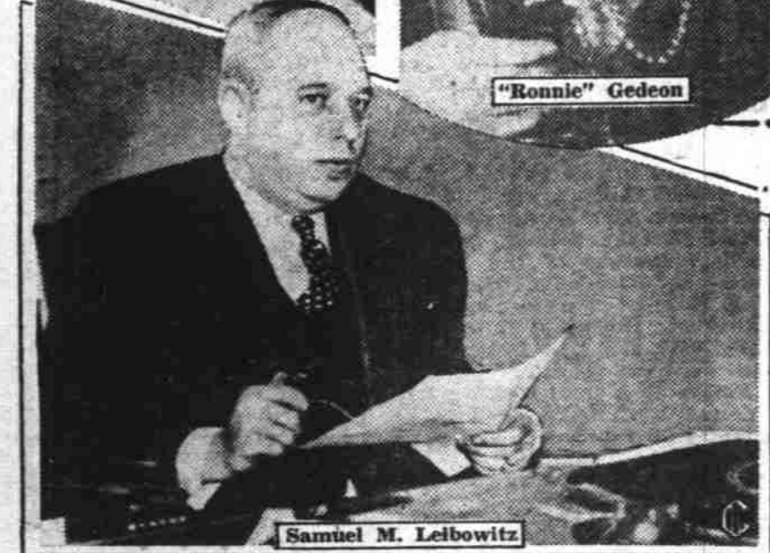
Samuel M. Leibowitz