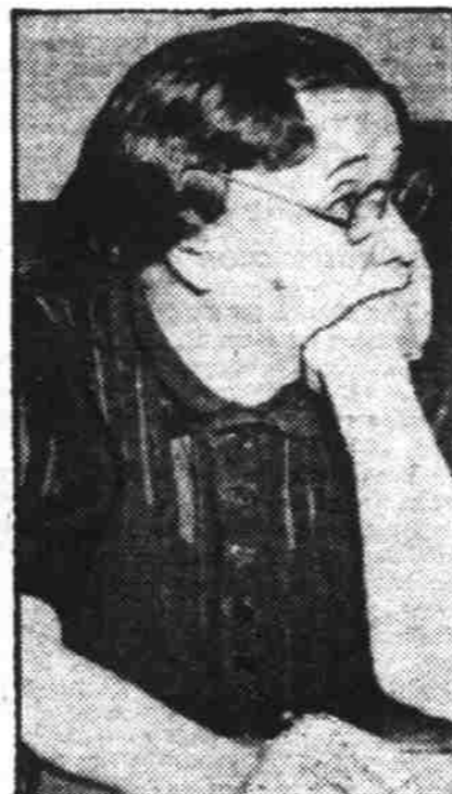
One of the hottest fights of this session of congress is between the southern bloc of legislators seeking crop loans, particularly on cotton, and the president who is determined not to authorize such loans until congress passes the administration bill to control crop surpluses. Senator Hattie Caraway of Arkansas, shown at the agricultural committee hearing, is one of those involved in the fight, as Arkansas is a cotton state.