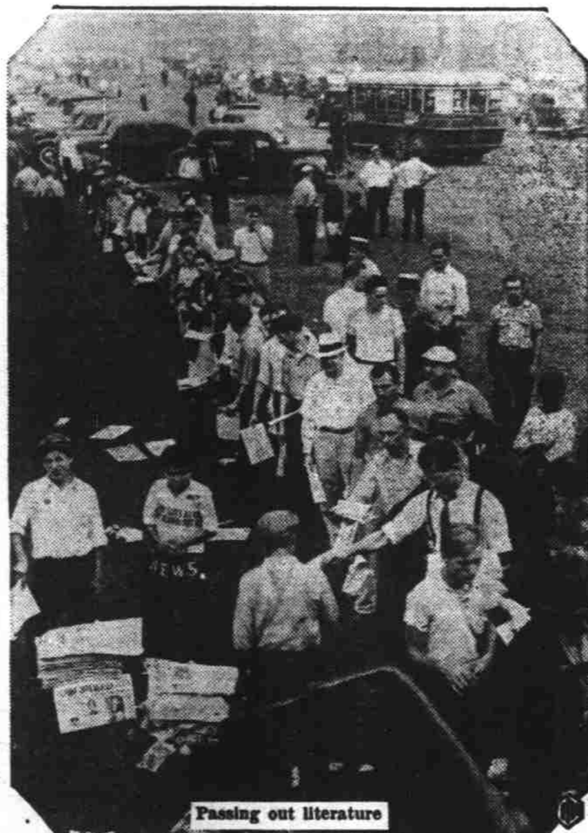
Passing out literature