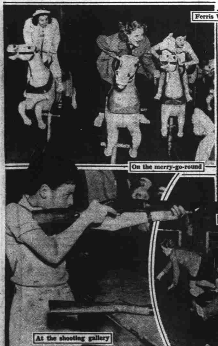
On the merry-go-round