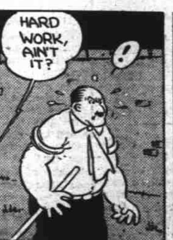
The Ghost Talks