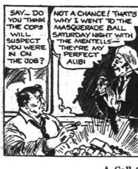
A Call to Sacrifice