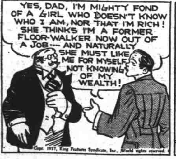
THIMBLE THEATRE—Starring Popeye