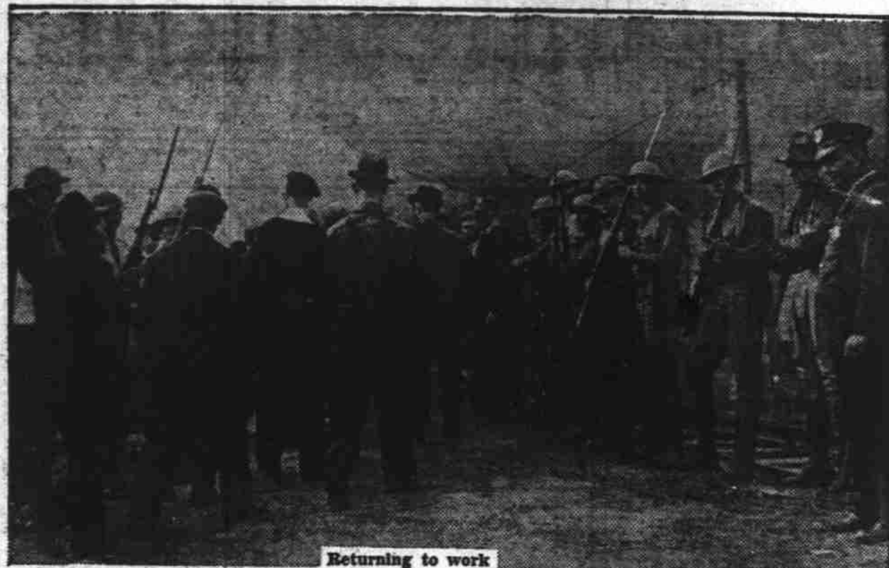
Returning to work