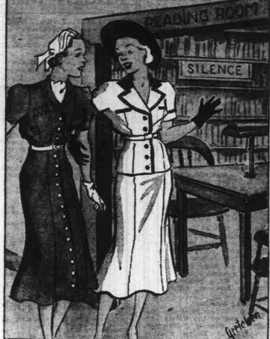
"Here's a nice quiet place where we can talk!"

s the only place we can think offhand where they would be out of tune. Otherwise they proved conclusively to us, how completely the well-dressed city tone is being carried off by tub frocks. A reddish tan, linen sports dress on the left used belt, buttons and scarf for white accent and, headward, we again noted the increasing use of turbans with sport things. White-striped navy trimmed the twopiece white frock on the right. A stiff navy felt saucer radiated widely, minus a crown.—Copyright 1937, Esquire Features, Inc.