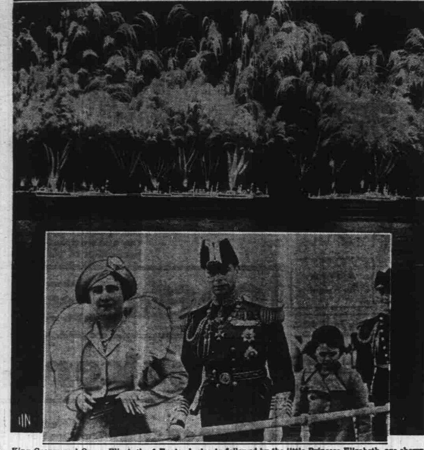
King George and Queen Elizabeth of England, closely followed by the little Princess Elizabeth, are shown on the royal yacht as they left Portsmouth for the King's first official review of the British fleet. Climax of the review, which included 180 ships, was a magnificent display of pyrotechnics, shown above at its height, lights blazing from stem to stern of each vessel.

King Reviews "Steel Wall" of British Defense