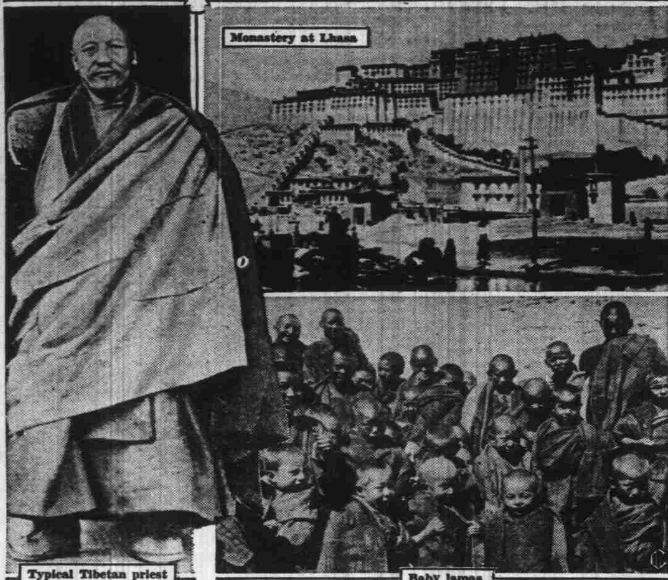
Typical Tibetan priest