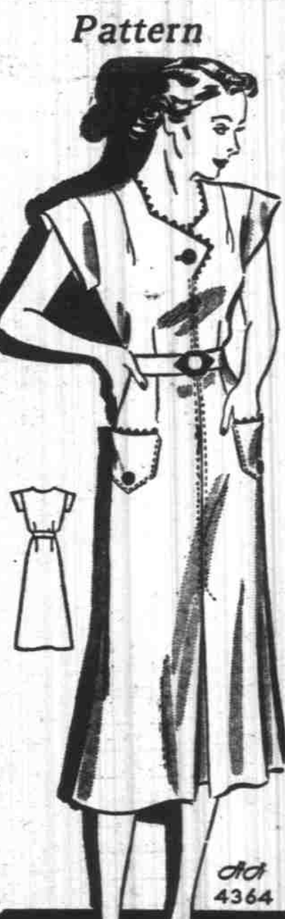
By ANNE ADAMS

5 ACRES, APPROX. 90 fruit trees and 40 cherry trees, fine pear, apples, etc. Bump, new barn, 6 room house, bath, new roof, enclosed porch, etc. Bump, new barn, 6 room house, bath, new roof, enclosed porch, etc. Bump, new barn, 6 room house, bath, new roof, enclosed porch, etc.