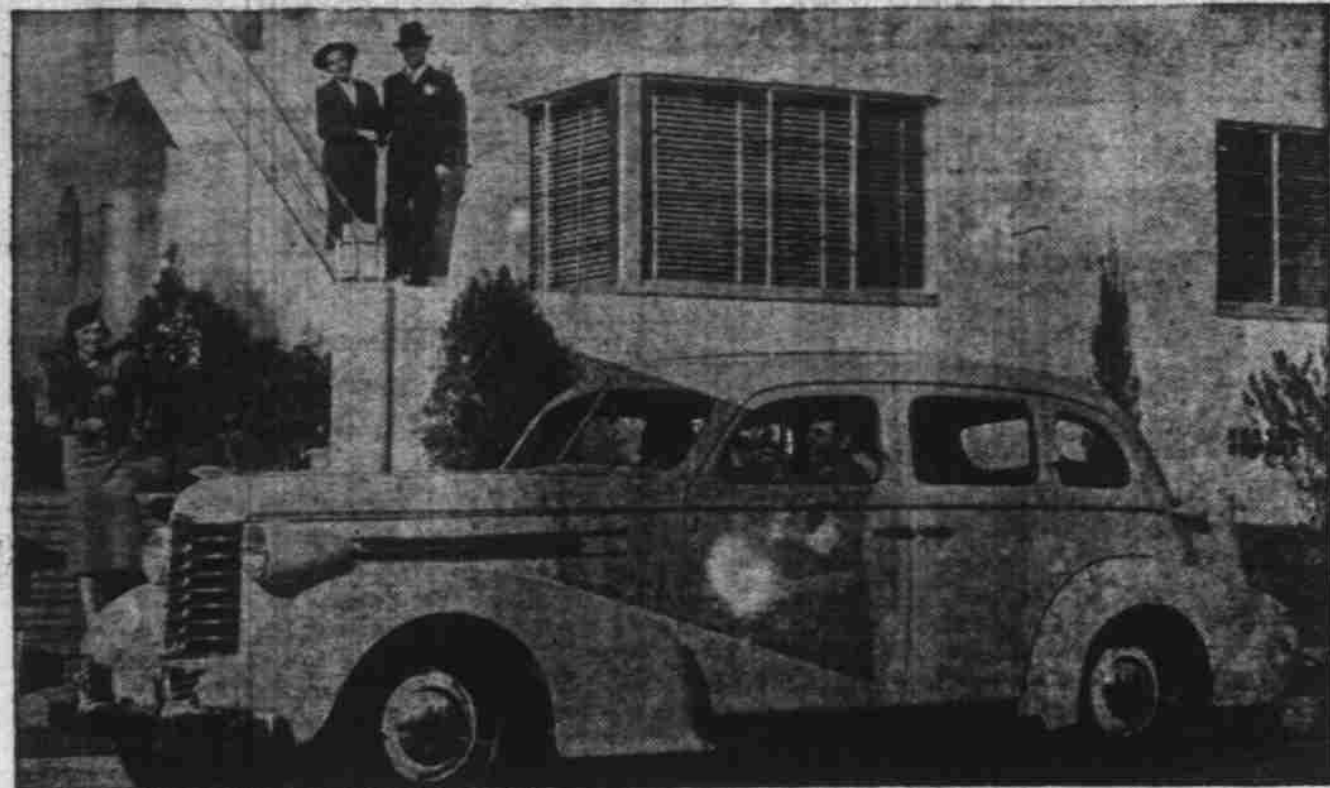
Individual styling with lines of unusual grace and beauty have earned for the 1937 Oldsmobile the title of "style leadership" according to Grady Gamble, northwest zone manager for Olds. Photo shows the Oldsmobile Six four-door touring sedan with trunk, one of the sales leaders. Bosell-Grimsen Motors, 350 North High street, is the local agency.