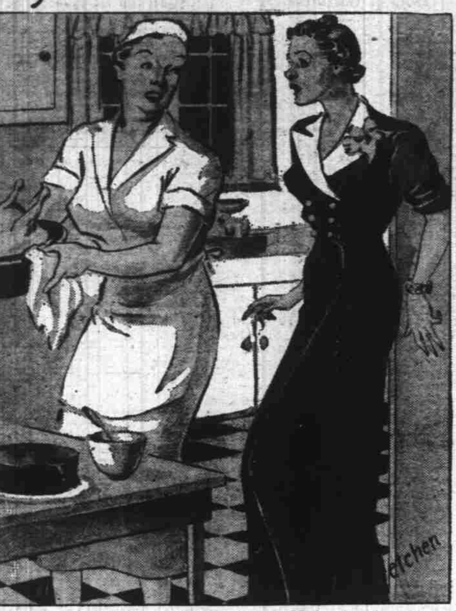
"You'd better not help me tonight, Mrs. Baldwin—I'm in a hurry!" If cook dashes ice water on your culinary efforts, return to your guests. Their admiration of the delectable concoction you are wearing in a "don't dress" dinner will warm your heart. The nautical touch and tailored revers of this fallie frock imbue it with informal charm, while the ankle length skirt (arched higher in the center front panel) makes it decidedly "evening."