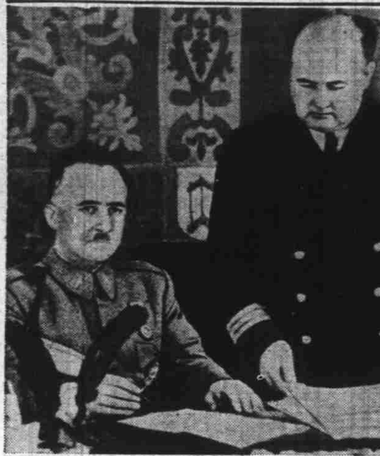
Here is one of the first pictures ever released of Gen. Francisco Franco, seated, chief of the Spanish Fascist forces, and his brother, Nicolas Franco, who serves as general secretary for the Fascists at their headquarters at Salamanca.

No. 66-45 Synopsis of Annual Statement of the Employers Reinsurance Corporation of Kansas City, in the State of Missouri, on the thirty-first day of December, 1936, made to the Insurance Commissioner of the State of Oregon, pursuant to law: Amount of capital stock paid up, $1,500,000.00.