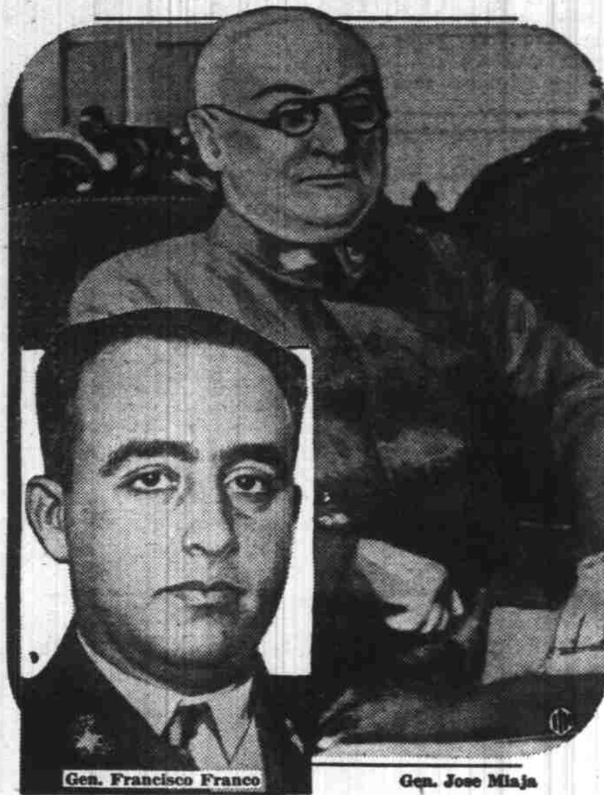
Credited with saving Madrid from the determined rebel attack headed by Gen. Francisco Franco, Gen. Jose Miaja, commander of the Loyalist forces in the capital, stands out as one of the notable strategists of the conflict. In contrast to the showy brilliance of Franco, Miaja depends on proven military tactics and massing of strength rather than flashy maneuvers. Born in Oviedo in 1878, he attended military academy and served in the artillery where he soon rose to rank of major. Eighteen years of his service was spent in Morocco where his exploits made him a legendary figure.