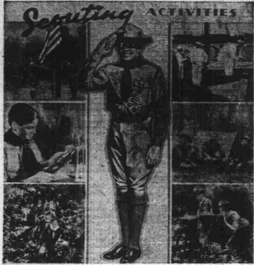
Coincident with the eve of the Salem district Boy Scout financial drive, which opens Tuesday, these photos depicting scout activities are shown. On the left, top, camp citizenship; center, wood-carving; bottom, hiking. On the right, top, seasouting; for older boys; center, camping; bottom, surveying.