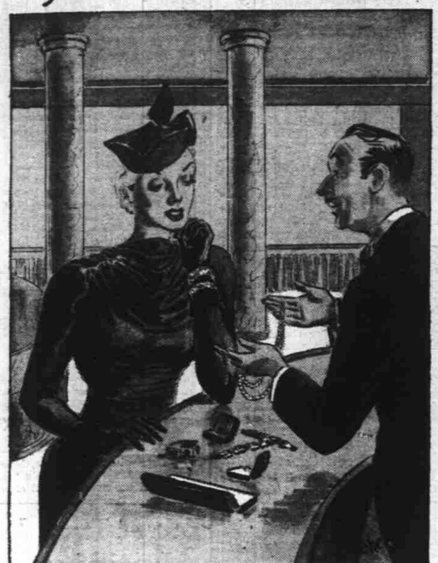
"If you're not planning to buy, why not let me show you something really expensive?"

There's no harm in looking—and a good observer won't pass up the interesting news that the recent rise of silk jersey to fashion fame continues its vogue unabated. Draped as here in a sort of apron effect it belies its homely description by appearing indeed rather dressy, in a manner suave and distingue. The crown of the shantung hat is shielded by a squared brim. Two antique gold bracelets gain prominence by acting as sole color relief.—Copyright 1937, Esquire Features, Inc.