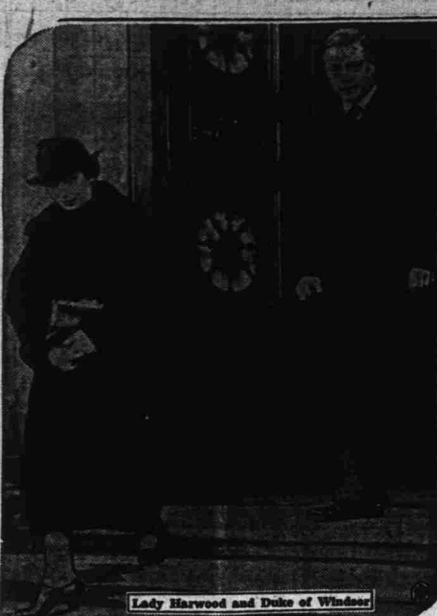
When Lady Harwood, Britain's Princess Royal, visited her brother, the Duke of Windsor, at his "exile" retreat near Vienna, Austria, above, she was supposed to have urged him to give up his plans for marrying Mrs. Wallis Simpson, but without success.