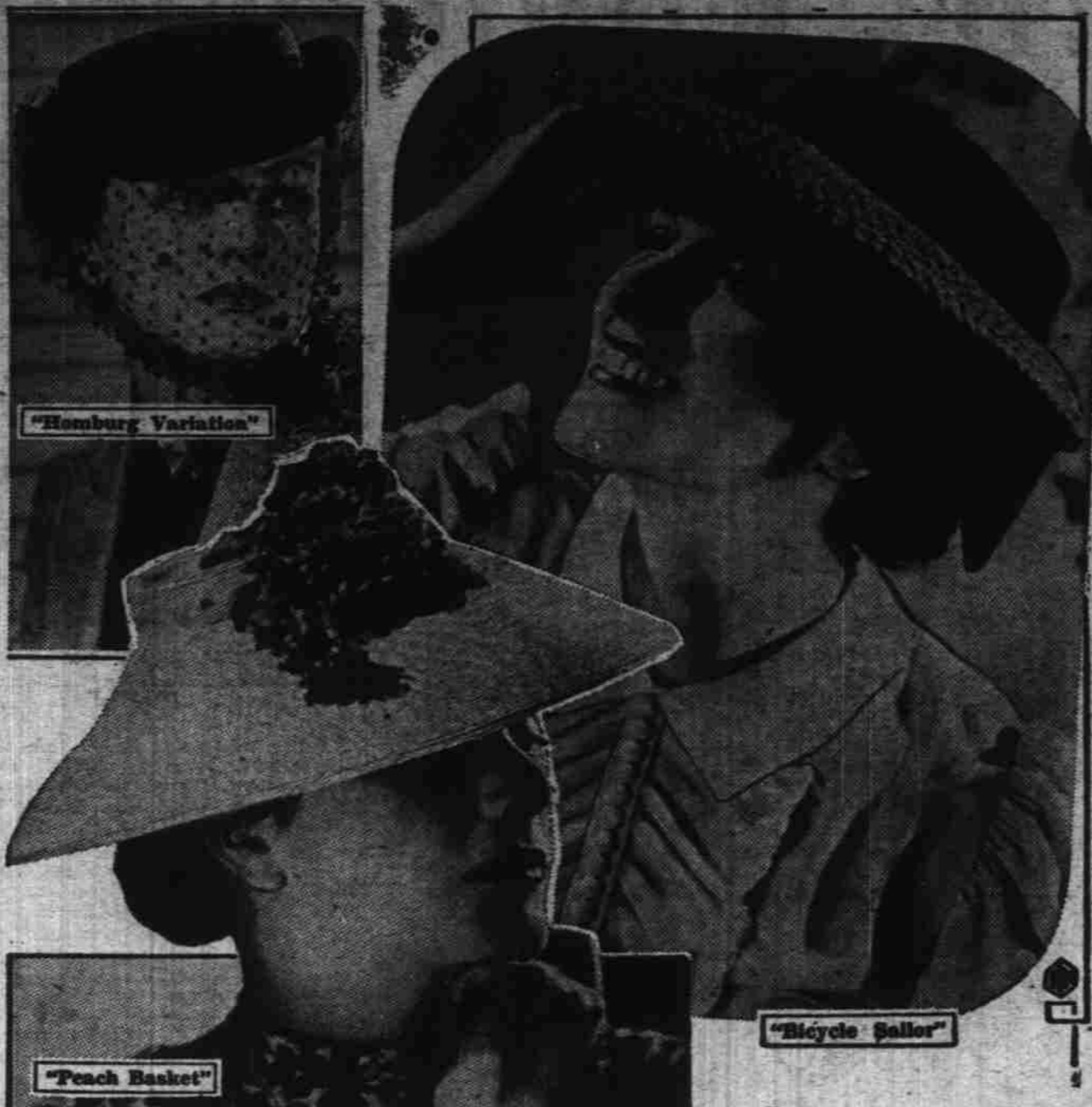
Advance showings of new spring hats indicate this year's styles will be gayly modernistic. Flowers and graceful veils are popular in the new models. The "peach basket" hat is made of natural woven Milan straw, with a cluster of red carnations on the front giving lovely color. The "Homburg variation" is a modern tribute to the "horseless carriage" days. "Bicycle sailor" hats, chic and attractive, are infinite in their variety this season, judging from present showings.