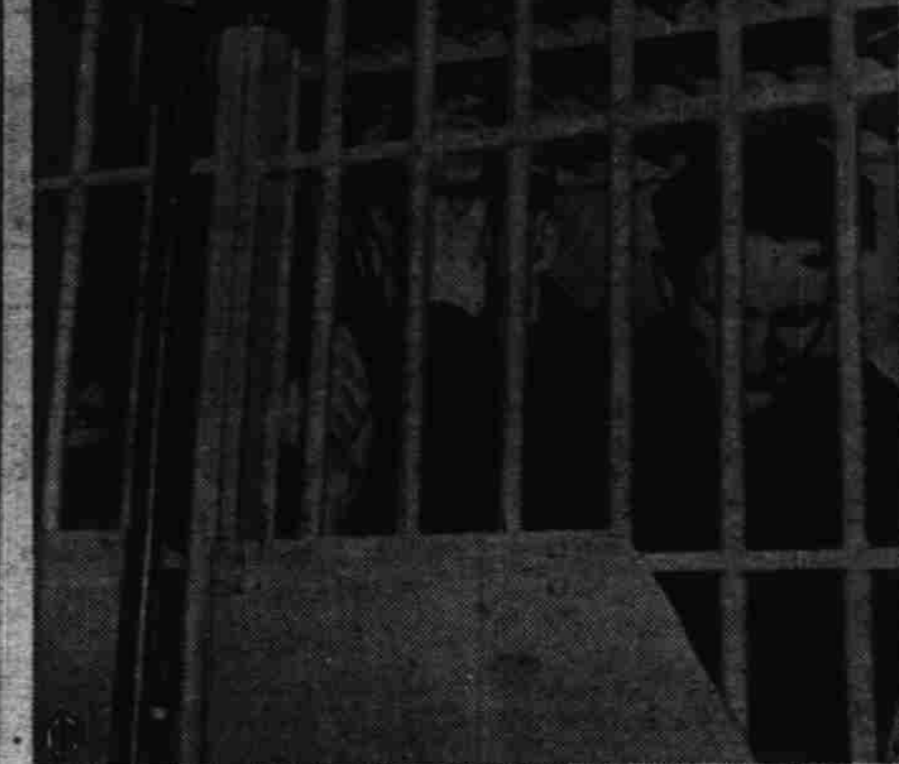
Students of McKeesport high school, McKeesport, Pa., are pictured in jail after they had participated in a "sit-down" strike when authorities forbade students to leave the school during lunch period. More than 1200 of the school's 3,000 students revolted against the order and 22, including several girls, were jailed. All were released after a hearing at which the students won a victory.