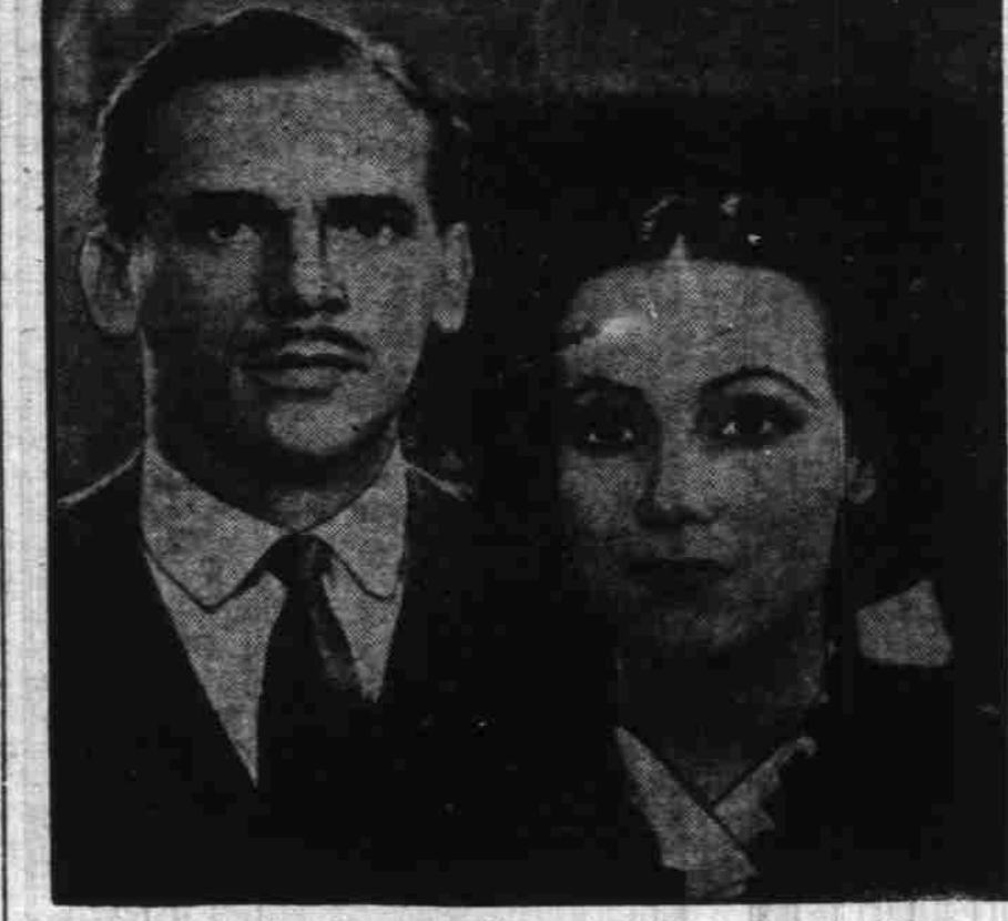
Douglas Fairbanks, jr., and Dolores Del Rio, stars in "Accused," murder mystery showing at the Capitol theatre,