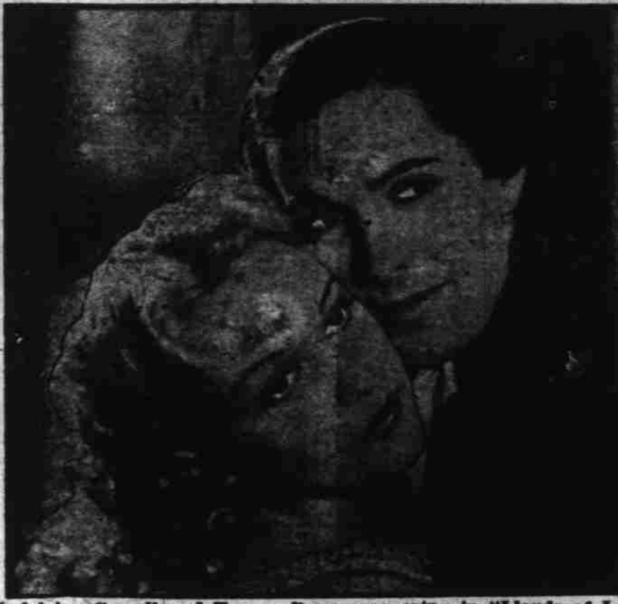
Madeleine Carroll and Tyrone Power appearing in "Lloyds of Lon-don," brilliant new Twentieth Century-Fox hit now playing at the Grand theatre