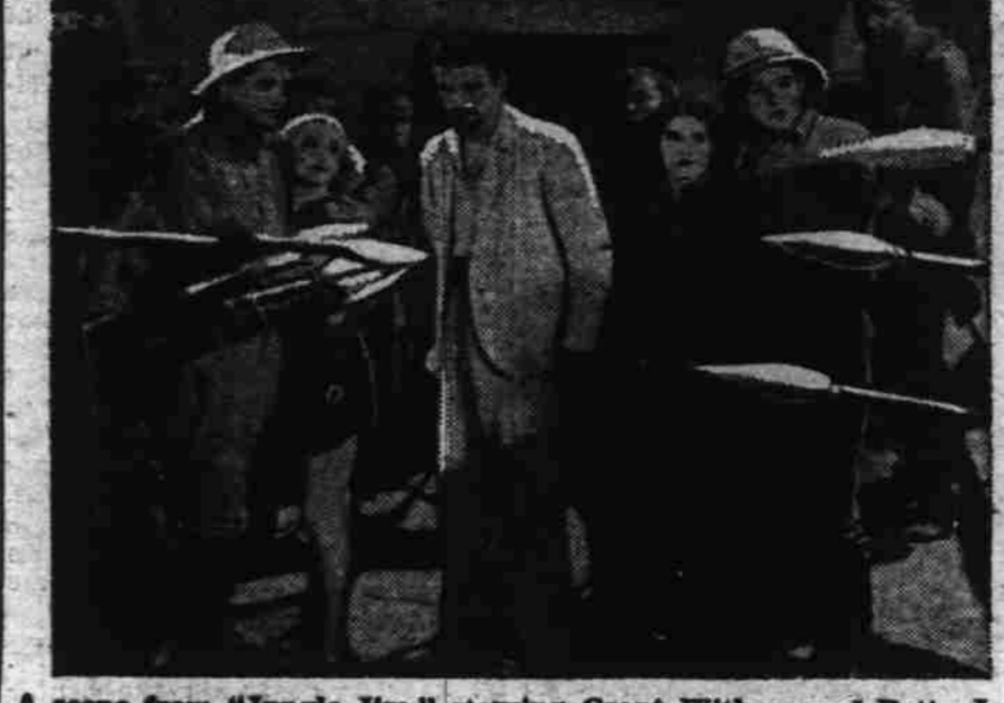
A scene from "Jungle Jim," starring Grant Withers and Betty Jane Rhodes, next serial for the Mickey Mouse club.