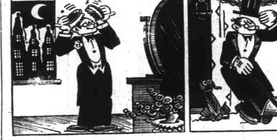
From the Grumble Seat