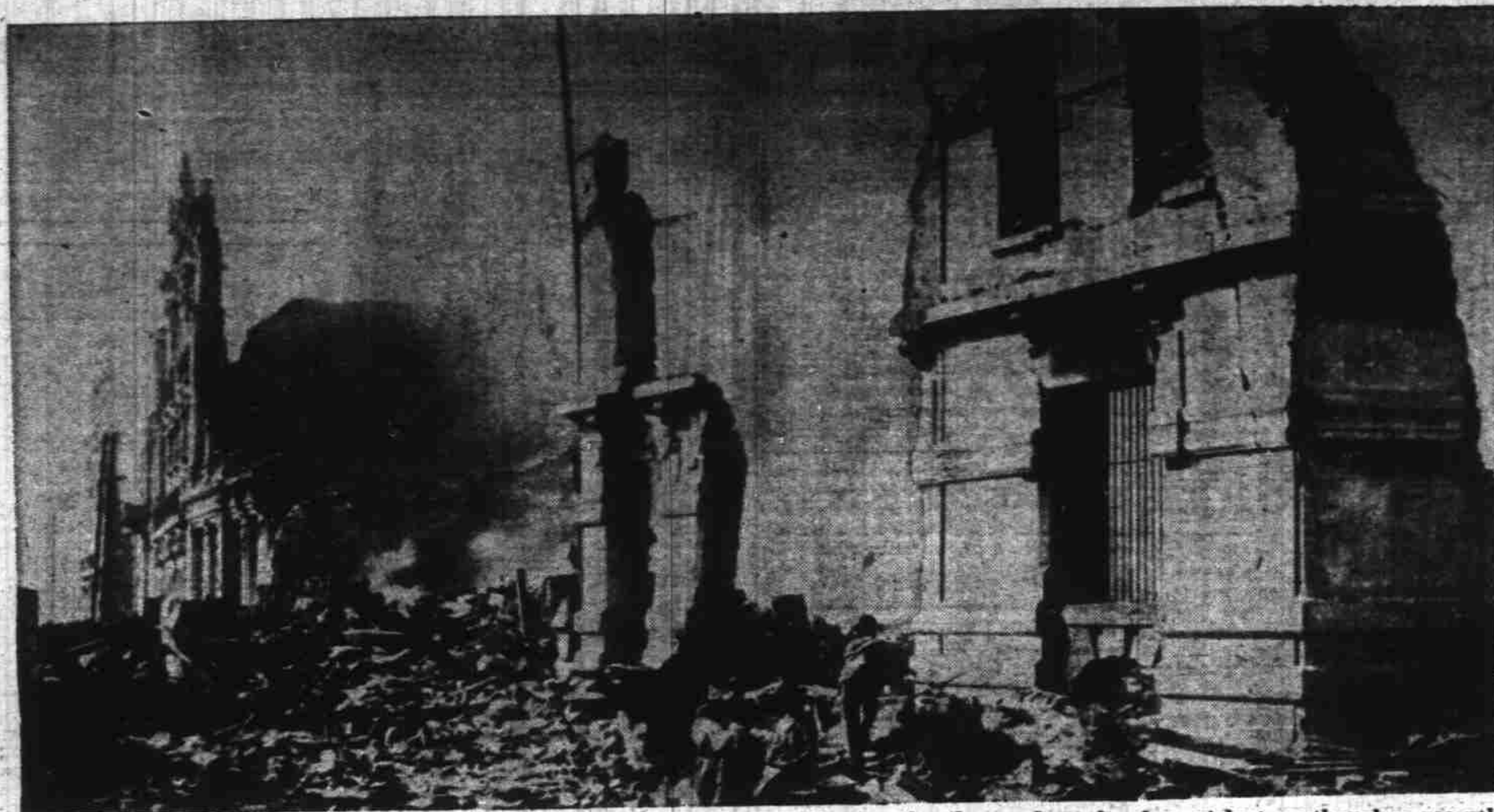
Hundreds were rendered homeless and the death toll was estimated to be well over the thousand mark when violent earthquakes recently shook the Central American republic of San Salvador, San Vicente, a city of 50,000 inhabitants, was the scene of the quake's worst ravages. While the tremors were rumbling at their peak, Mount San Vicente, a volcano near the stricken city, burst into eruption, showering ashes on the terrified populace. Photo shows a similar catastrophe which happened in San Salvador in 1917.