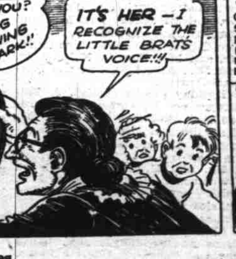
And Don't Spare the Horses