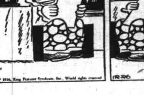
From the Grumble Seat