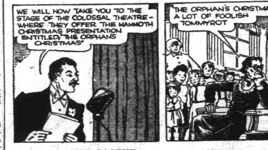
And Don't Spare the Horses