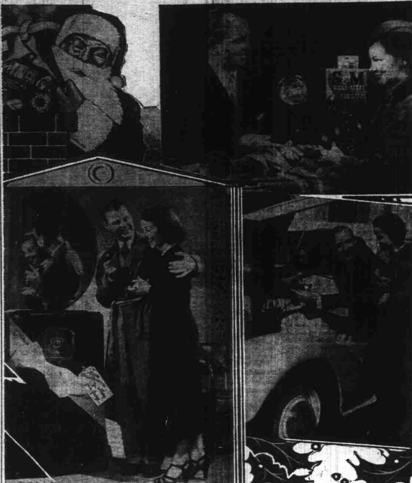
Jolly old Saint Nick has found that gifts which seem most enjoyed and most indicative of the giver's thoughtfulness are accessories for the car, such as the pretty miss, lower left, is considering . . . or a Western Air Patrol radio, lower left . . . or the streamlined compass that the young woman above is inspecting . . . Any of them may be found at Western Auto Supply.