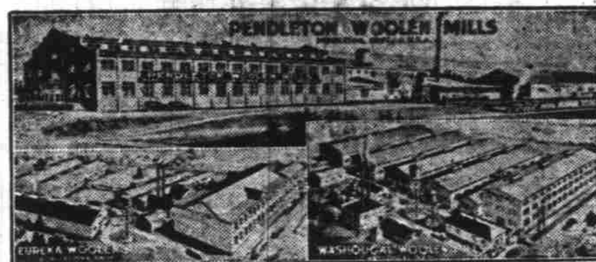
Showing Three Large Woolen Mills of the West . . . Owned and Operated by The Bishop Organization.

The Name Pendleton Is Known Throughout the Nation as One of the Foremost Lines of America