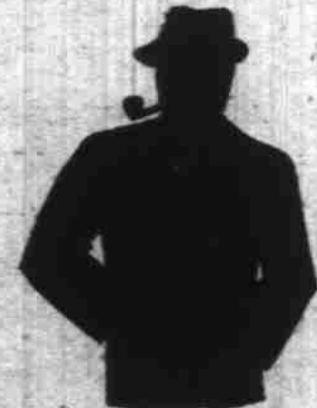
An Extra Fine Fitting Ribbed Coat—Staple the Year 'Round

The Alderwood Knitting Mills at Portland, Oregon, are happy to be among the exclusive list of Quality Manufacturers from whom Bishop's select their merchandise.