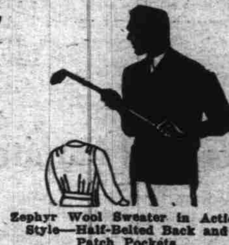
Ezephyr Wool Sweater in Action Style—Half-Belted Back and Patch Pockets

The Famous Alderwood Sweaters Featured at the New Bishop's