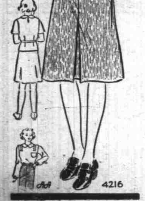
By ANNE ADAMS Sure to be the pride of a Junior's wardrobe is Pattern 4216, and a style-setter for the rest of her fashion-conscious set! So easy to make is this jaunty two-piece that a "teen-age Miss may cut and stitch it all by herself! There's variety in the choice of long or short sleeves, and see how the blouse may be worn outside the trim skirt or tucked in, shirt-waist fashion. Why not make several versions of this practical frock? Match the two pieces, and run the frock up in cotton-tweed, velveteen, crepe or challis; then make it again with a wool skirt and contrasting crepe or cotton blouse. Economical, isn't it? Aren't the Peter Pan collar, contrasting bow and patch pocket smart?

Pattern 421 is available in sizes 8, 10, 12, 14 and 16. Size 14 takes 2 1/2 yards 54 inch fabric. Illustrated step-by-step sewing instructions included.