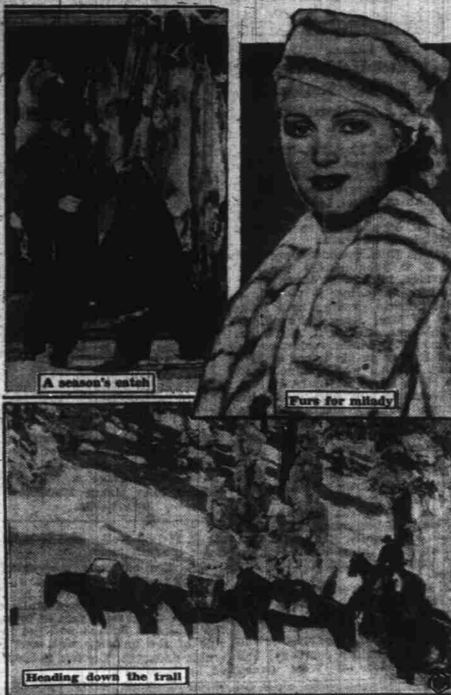
Few of the charming ladies who protect themselves from winter winds with a coat or neckpiece of fur appreciate the extent of the industry which makes possible their luxurious wraps—an industry which is now getting ready for another season. More than 2,000,000 trappers in United States are now preparing for their annual trek into woodland and marsh in quest of furs whose total value is expected to be in the neighborhood of $65,000,000 for the 1936-37 season.