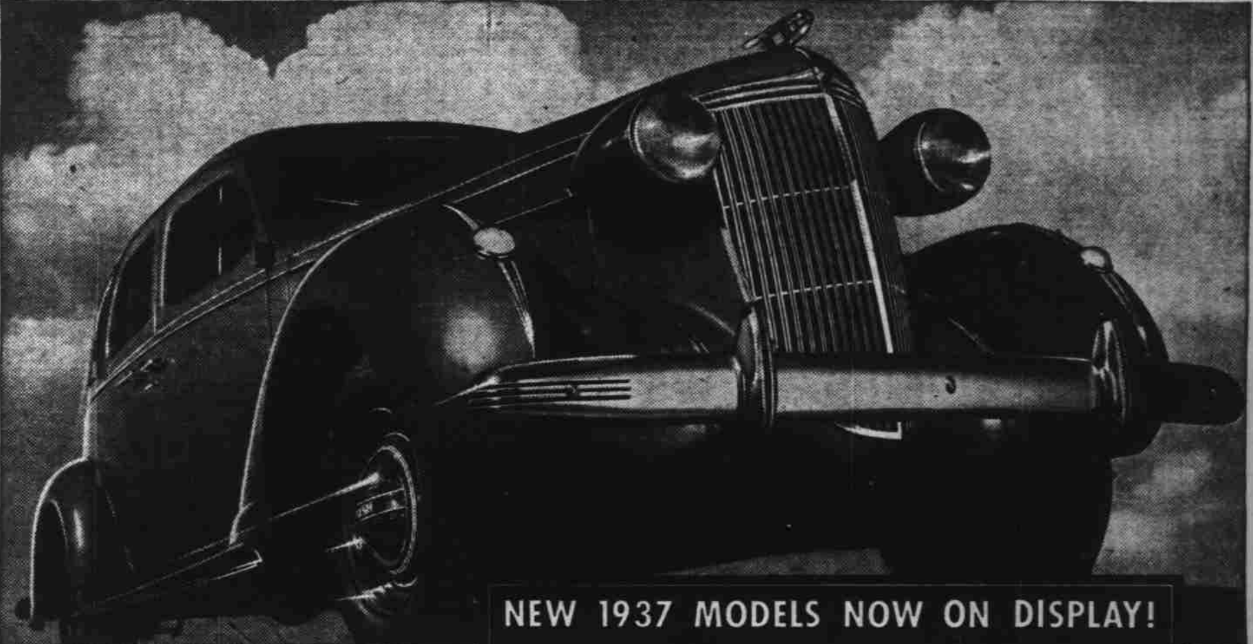
(Car illustrated in Nash Ambassador Six)

Again Nash is out to win with greater value . . . again Nash is a step ahead of the industry with bigger cars, more luxurious cars than America has ever before seen at anywhere near these prices. See them . . . and you'll get an entirely new conception of the kind of car you can afford this year!