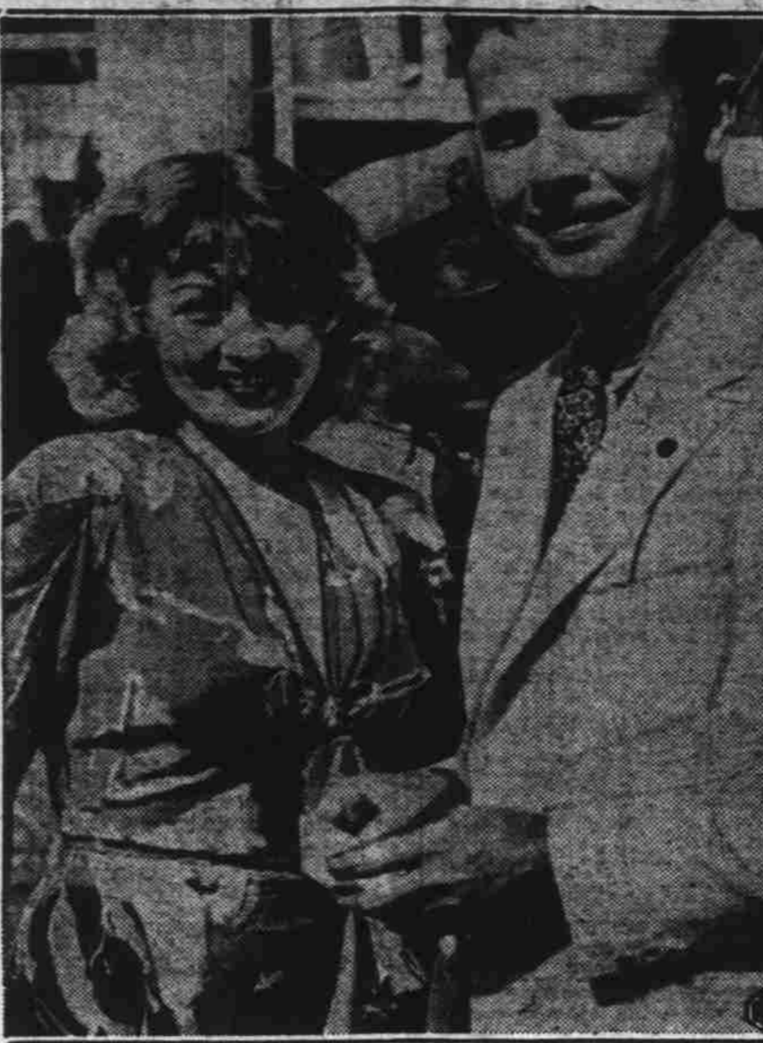
Mr. and Mrs. Dick Powell Stopping off at Havana, Cuba, on their honeymoon trip to New York. Dick Powell and his beautiful bride, Joan Blondell, were greeted by crowds of autograph seekers, above.