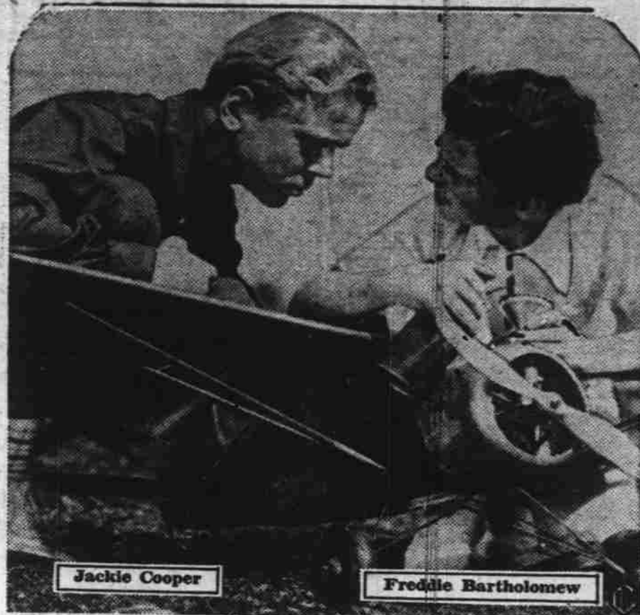
Although Jackie Cooper, left, and Freddie Bartholomew, right, are among the higher priced film stars of Hollywood, they proved to be little different than other lads their age when they established a record endurance flight of one hour and 47 minutes with their motorized model plane, built by Reginald Denny, film star.