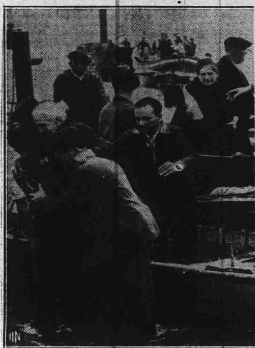
As the rebels occupied Irun, these Spanish refugees made their escape from the burning city by boat to Hendaye, France, where they found a safe haven with their pitiful possessions. This scene shows an aged woman receiving a helping hand.

Ships; order approving the payment of $214 for advances made by guardian.