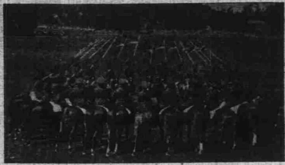
The 11th Cavalry exhibition platoon from the Presidio at Monterey, Calif., will be a super-attraction at the Diamond Jubilee state fair night horse show, opening here Monday. Above, a formation in the musical drill.

goers, will be a floor show each night. Artists who have appeared in leading theatres and night clubs of the country will present this event.