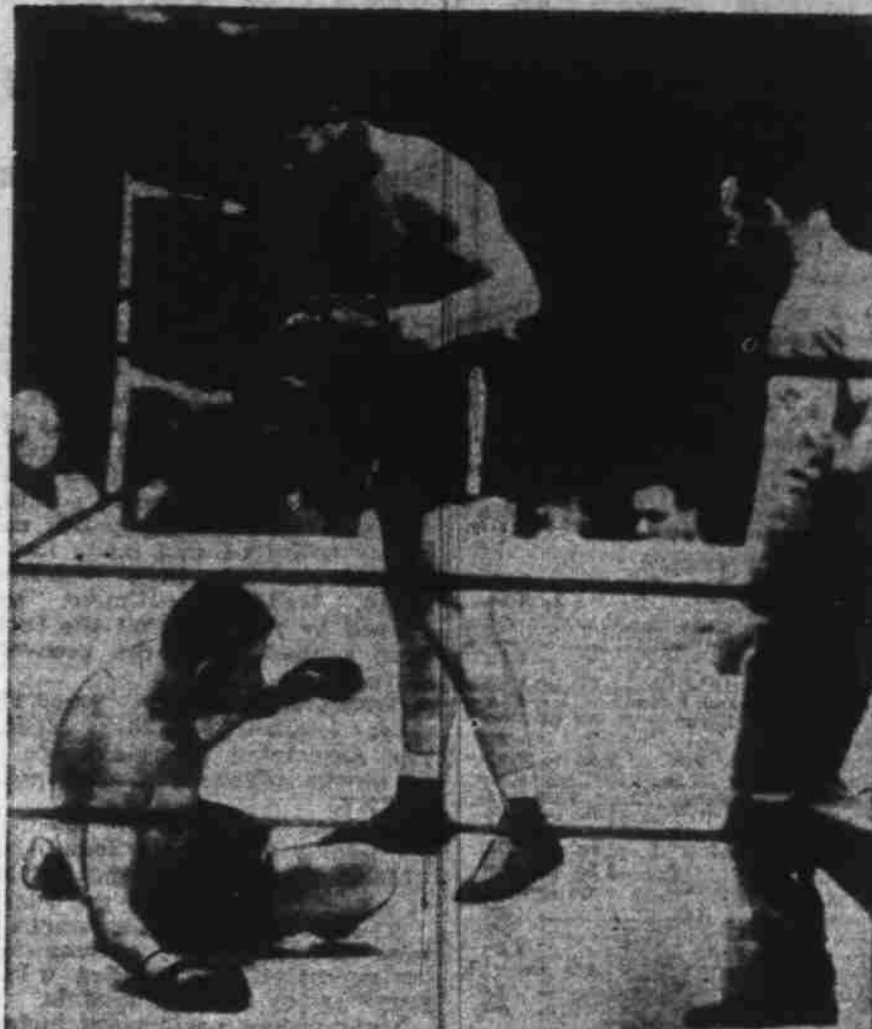
After being knocked down for the count of nine twice in the second round, Jack Sharkey was knocked out by Joe Louis at the opening of the third round of their battle at the Yankee Stadium in New York City. Nearly 35,000 fight fans witnessed Sharkey's defeat. This photo, transmitted over telephone wires by sound waves, from New York to San Francisco, shows Joe Louis standing over Jack Sharkey after Louis had driven a terrific right to Sharkey's chin, knocking him out.