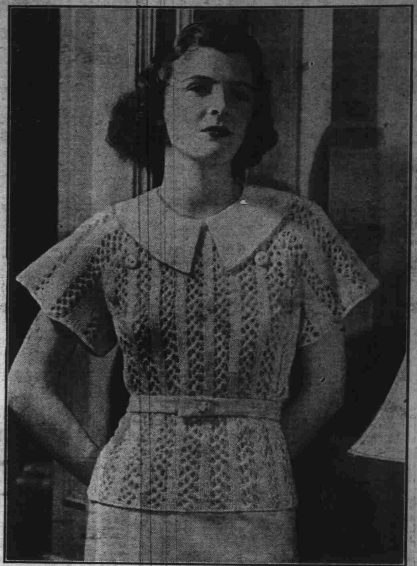
You'll be courting admiration when you step out in this Laura Wheeler blouse—a jiffy-knit that molds itself to the figure with such supple grace. If you'd do your knitting quickly, here's your pattern—the very laciness of this design makes it easy to knit! Half the stripes are in a simple lace stitch, while alternate stripes, the collar and belt are just plain knitting. If you'd be economical, here's your choice—It's made of Shetland Floss. Speed—economy—style—all are combined in this all round blouse that's just the thing to dress up sports suit or extra skirt. And go right on and knit a skirt to match. Pattern N1008 contains detailed directions for making a blouse and skirt in sizes 16-18 and 20-22; illustrations of the blouse and of all stitches used; material requirements. To get Pattern N1008, send 10 cents to our Needlecraft Department, The Oregon Statesman.