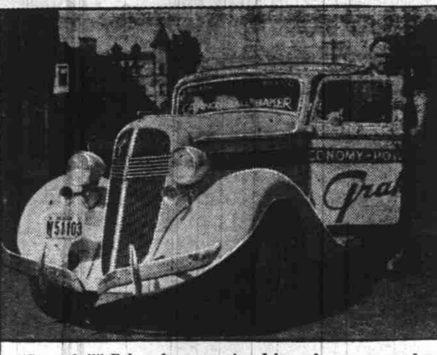
"Cannonball" Baker, famous racing driver of years ago and now a road driver, shown arriving in San Francisco on his economy run from Vancouver, B. C., to Agua Caliente, Mexico. He drove a stock Graham Crusader and turned in the remarkable gasoline consumption record of 28.15 miles per gallon for 1639 miles. On his way south he stopped at Loder Bros. garage, Salem agency for Graham cars.