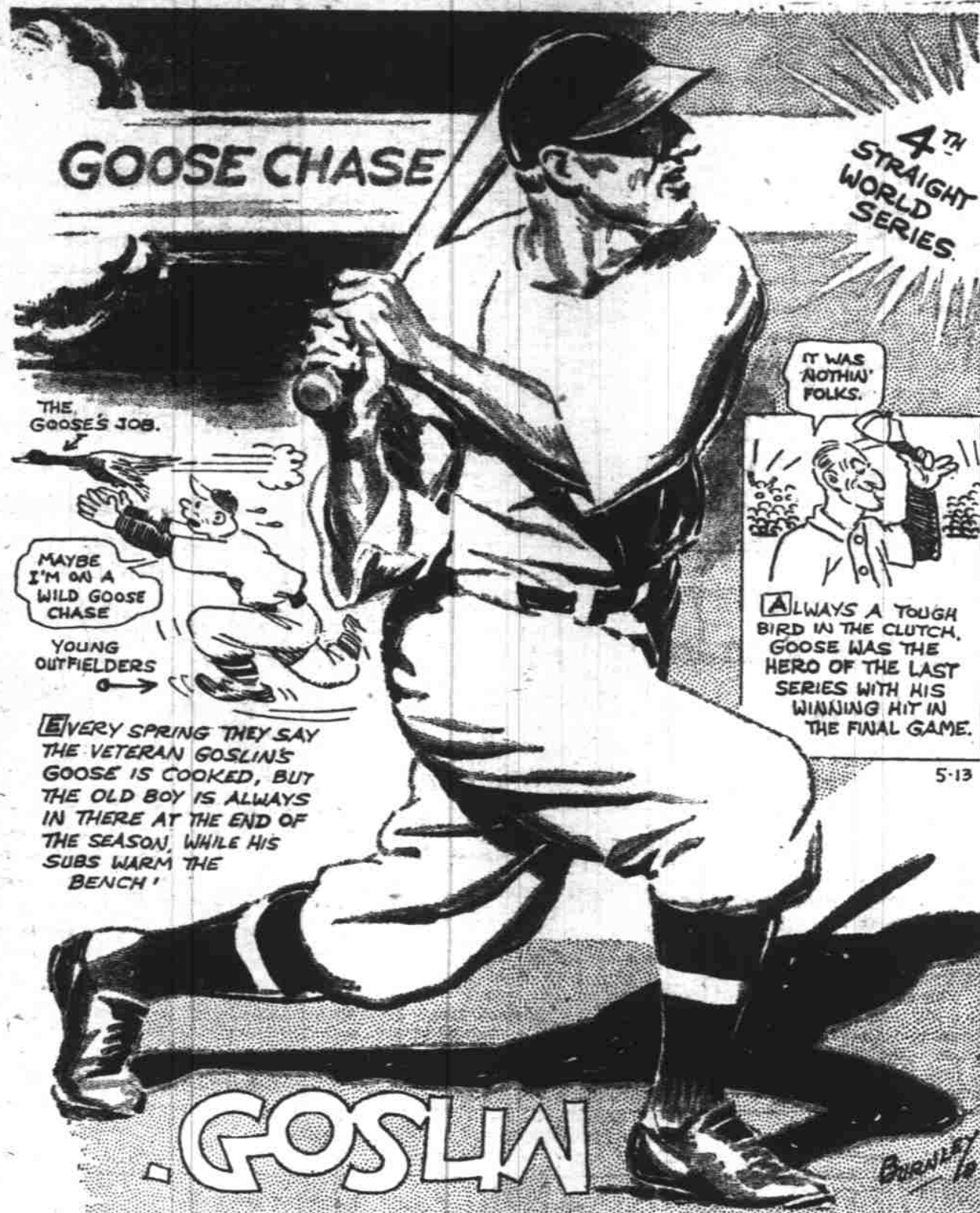
—OUT TO SET A NEW MARK BY PLAYING IN HIS 4 TH STRAIGHT WORLD SERIES.

THAT grand old bird with the elongated beak, "Geese" Goslin, the Goose from Detroit, is one of the great veterans of modern baseball. Goslin has been in the big show for nearly a decade and a half, yet major league moundsmen will tell you that they would rather face almost any other batter than the Goose in the pinches.